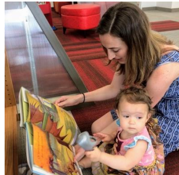
REDUCE BARRIERS TO ACCESS