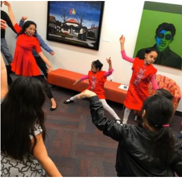
LATINO COLLECTION AND RESOURCE CENTER