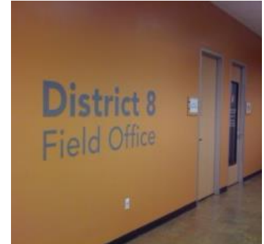
CO-LOCATED COUNCIL FIELD OFFICES