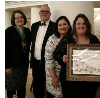
NATIONAL AND LOCAL RECOGNITION