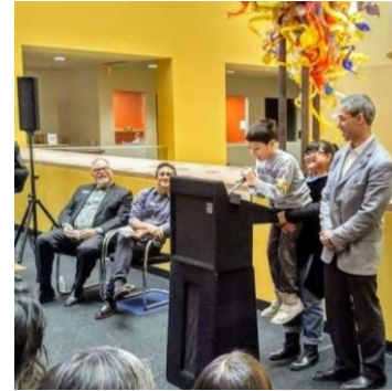
OUR FAMILY READS: THE MAYOR'S BOOK CLUB