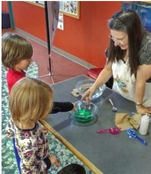
FUTURE HISTORY MAKERS TRICENTENNIAL EDUCATION DAY