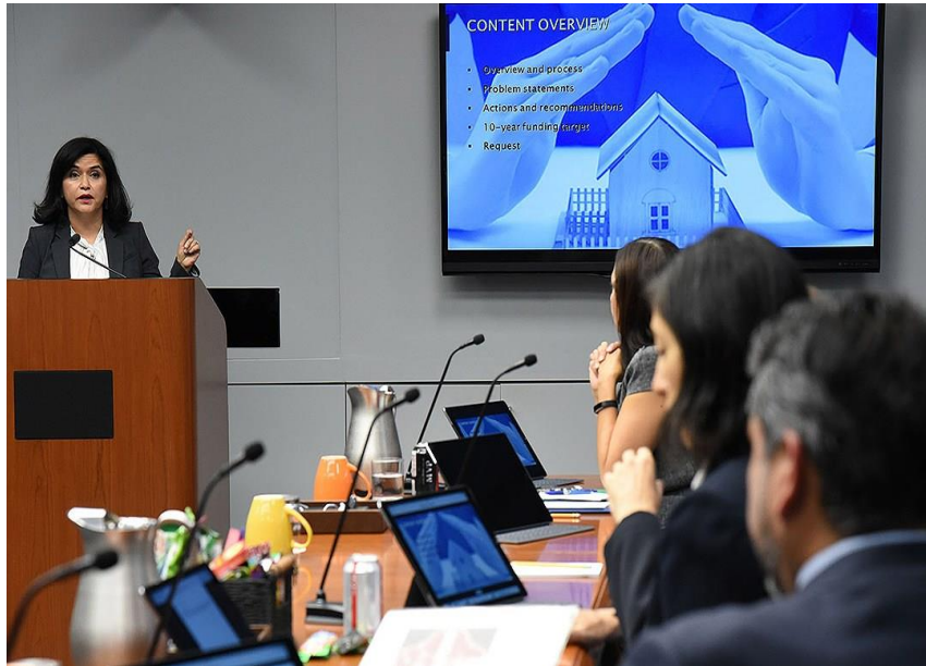
June City Council “B” Session Recommendations