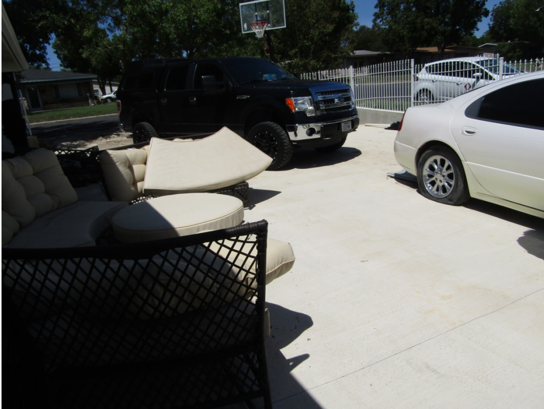
Subject Property side view