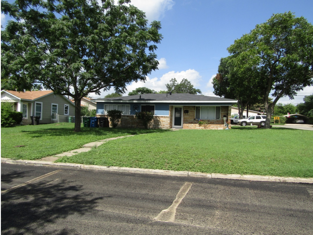
Neighboring property across the street