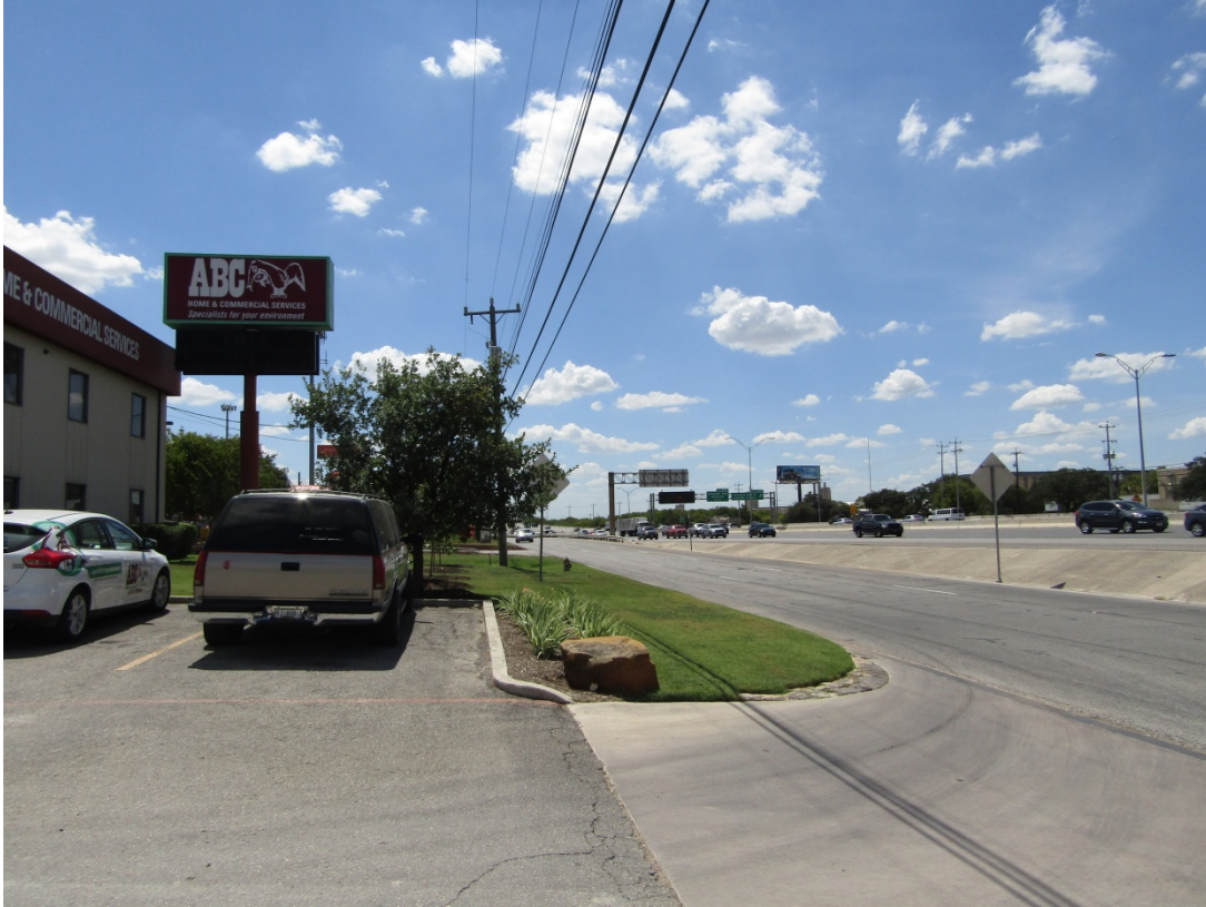
Street View (east)