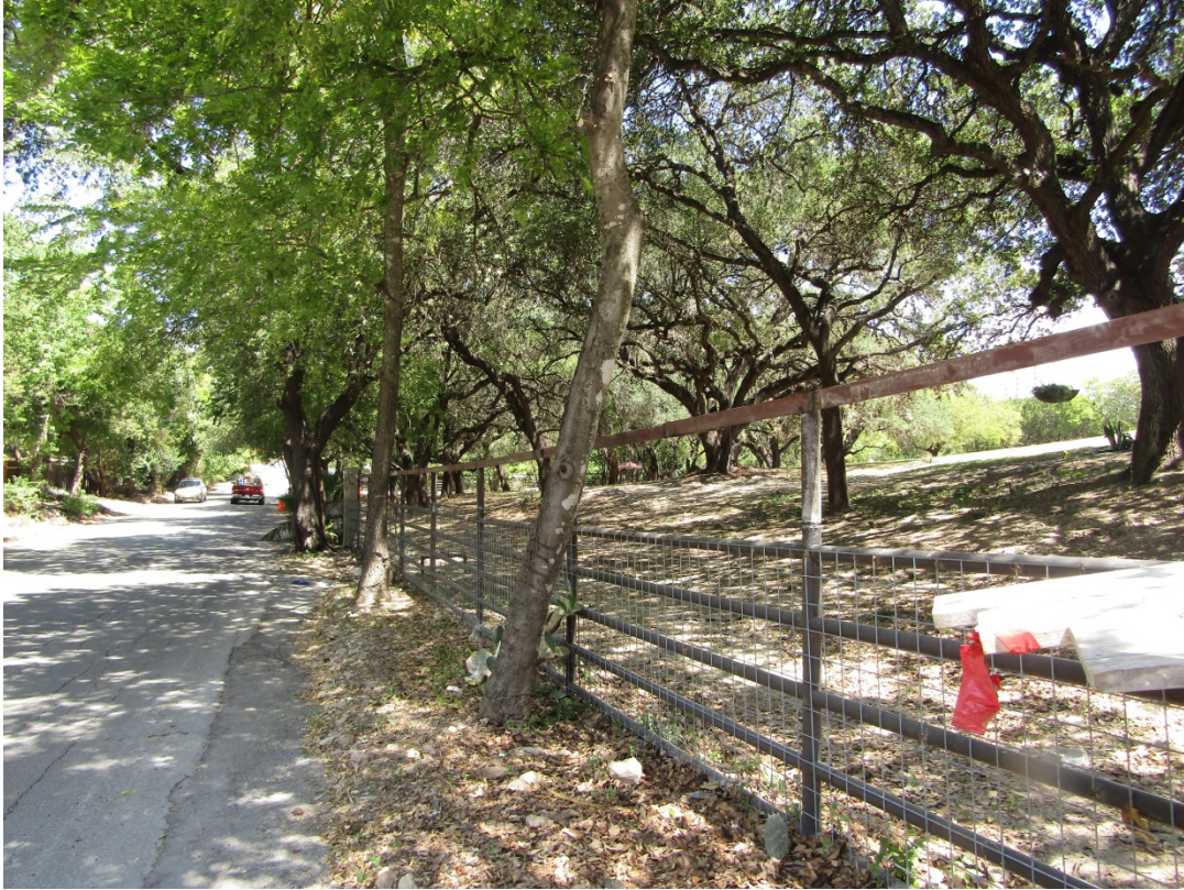
Subject Property and Streetscape