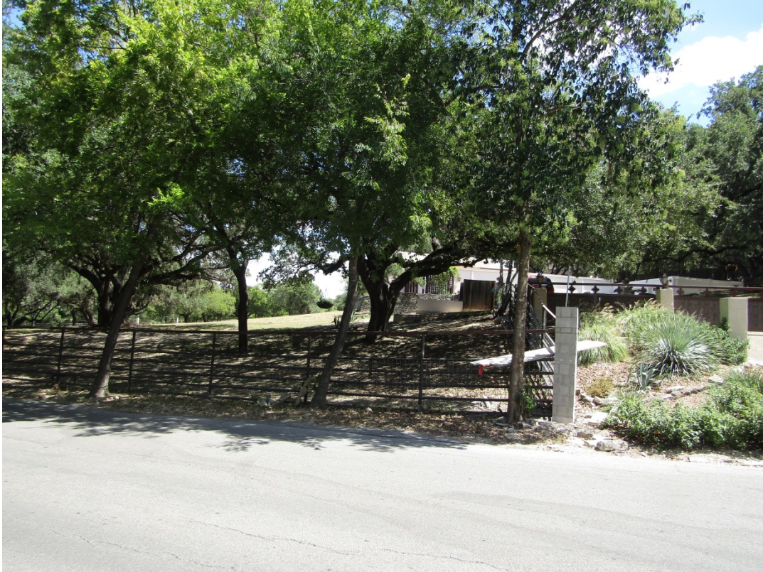
Subject Property 8' columns