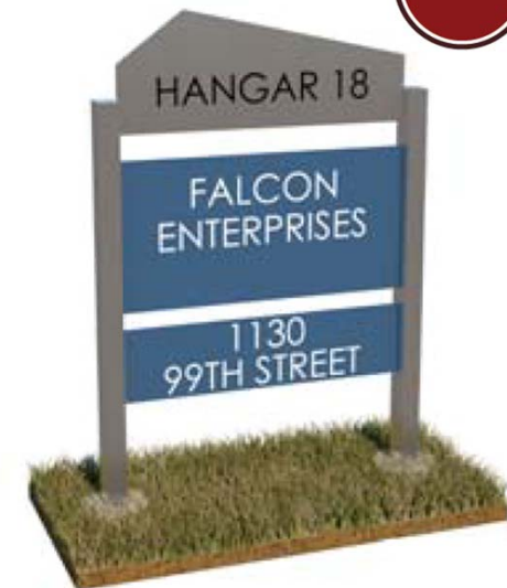
15 Tenant Signs