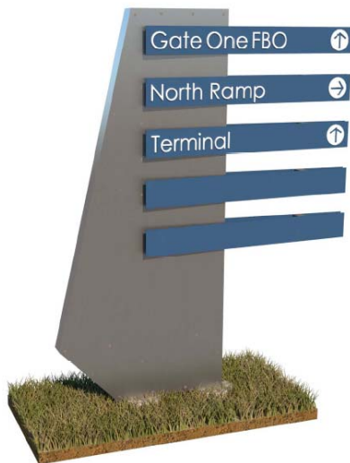
12 Directional Signs