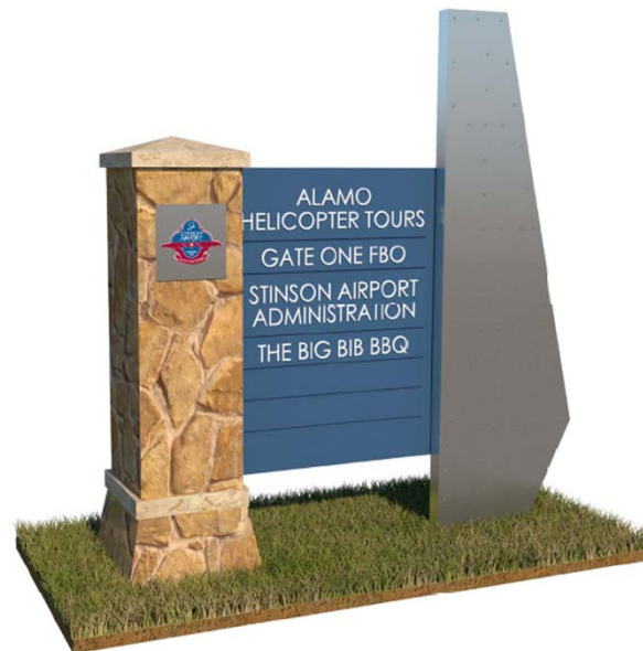
2 Directory Signs