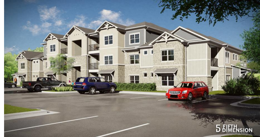
Mesa West Rendering