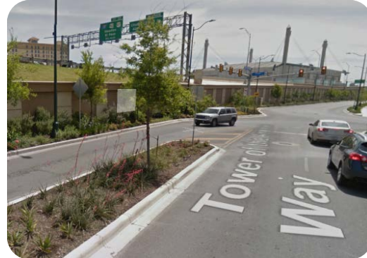
Road Vegetation Maintenance