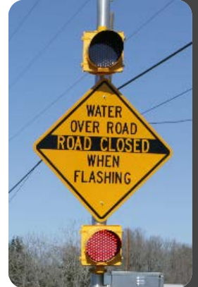
High Water Detection