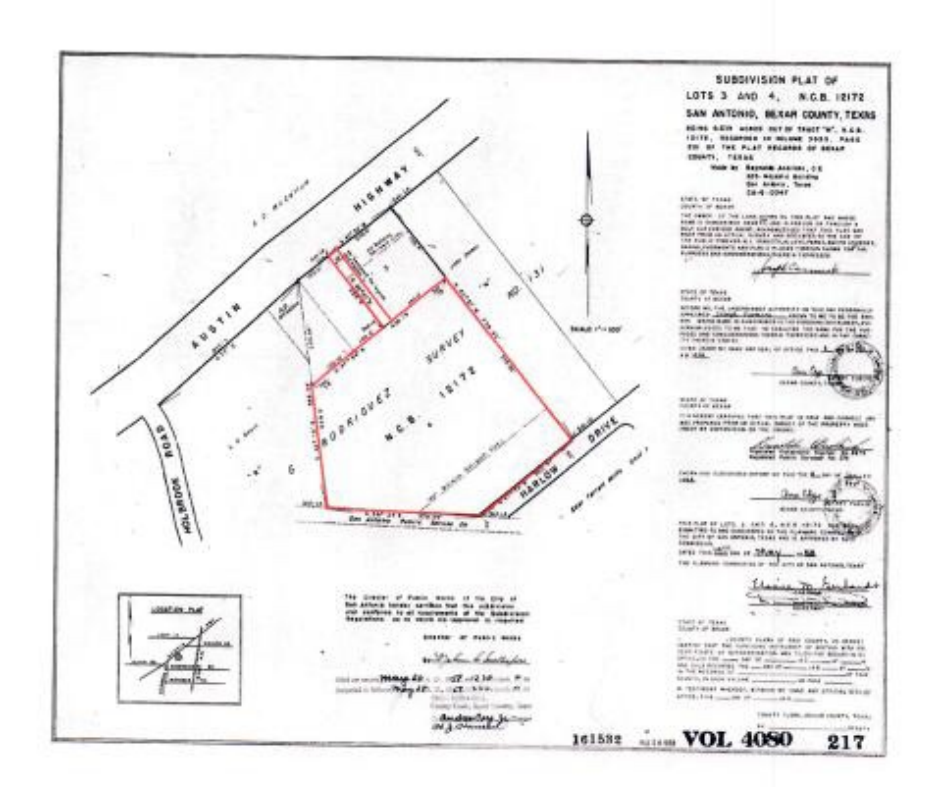
Exhibit A: Description of Premises