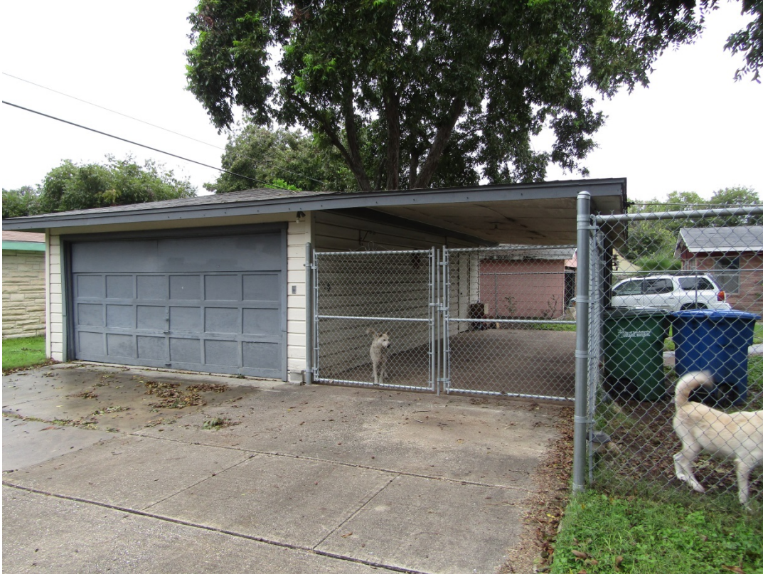
Property across subject property