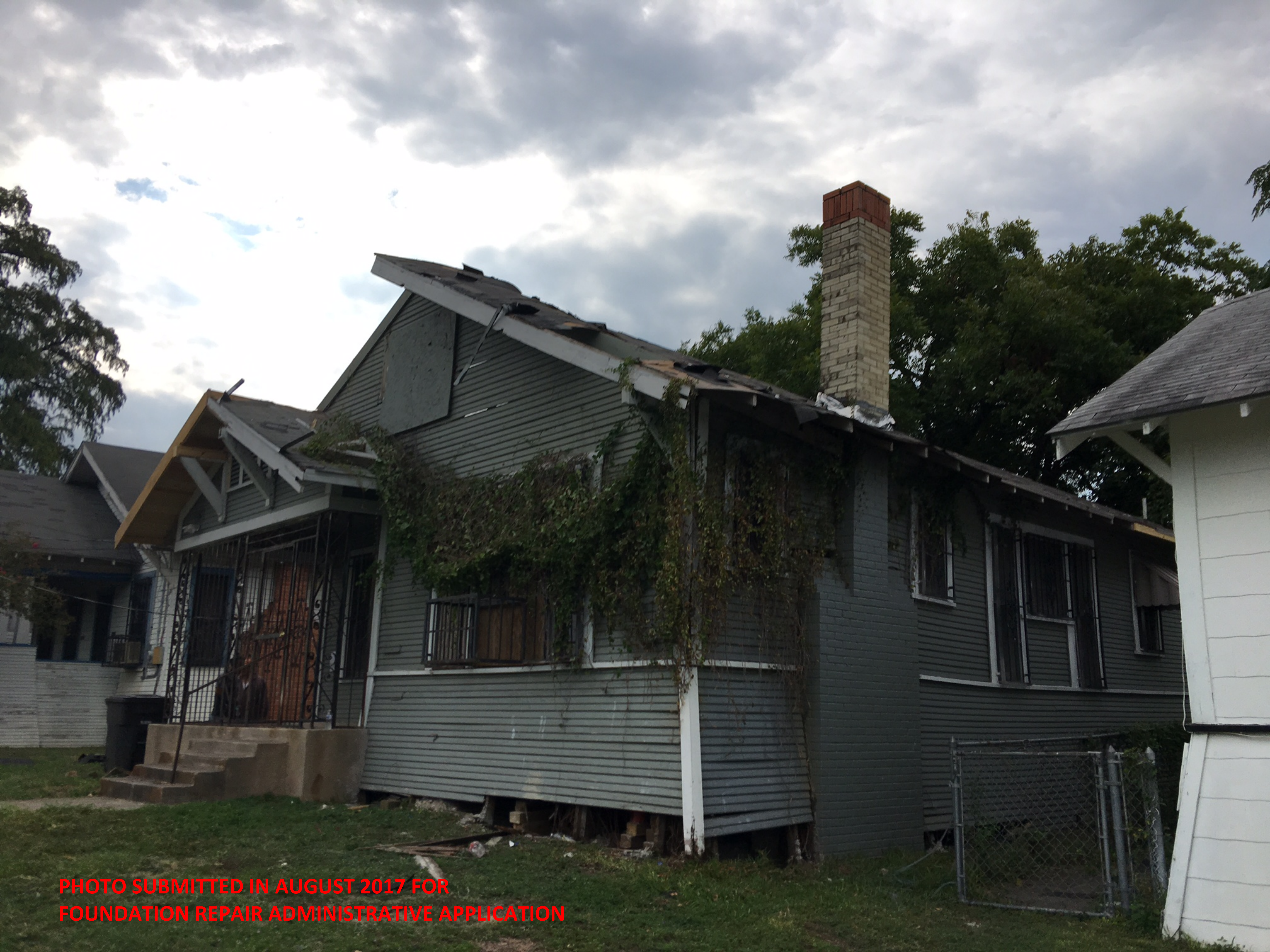
PHOTO SUBMITTED IN AUGUST 2017 FOR FOUNDATION REPAIR ADMINISTRATIVE APPLICATION