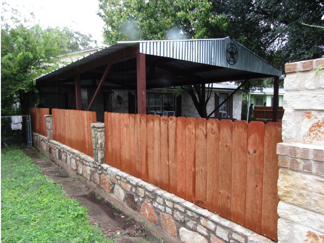
West Emerson Avenue view