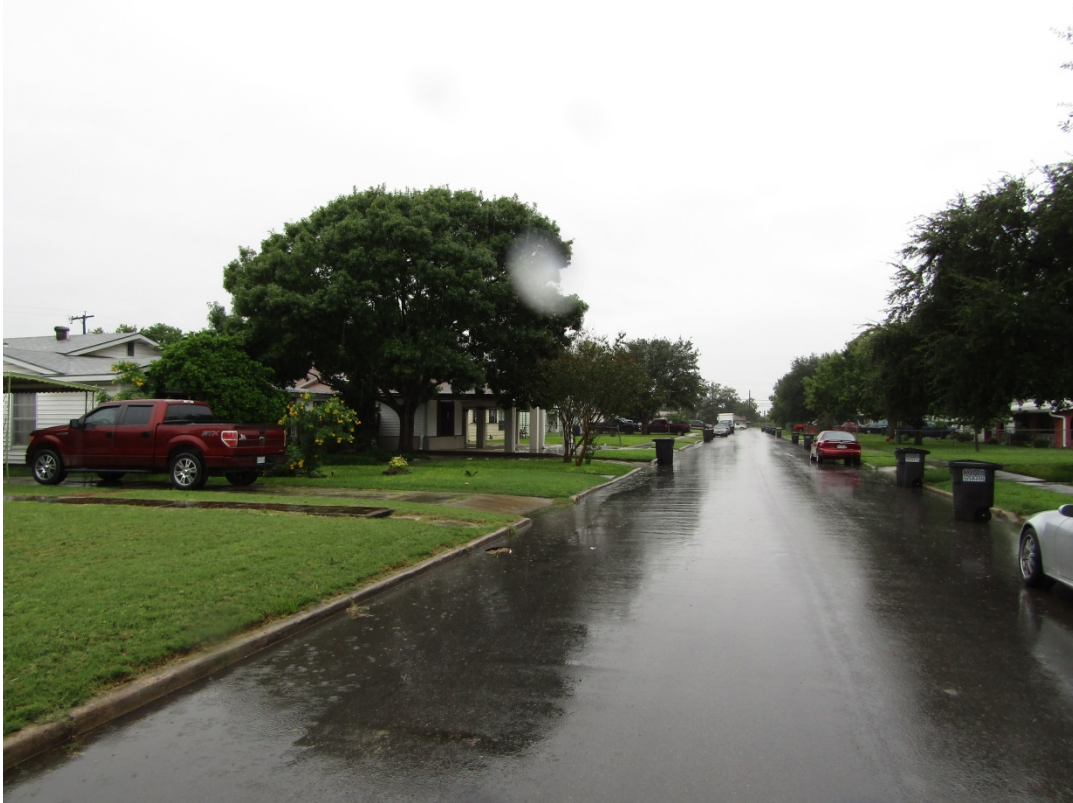
Neighboring property to the West