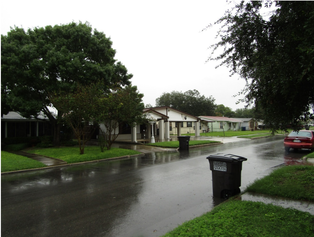
View across subject property