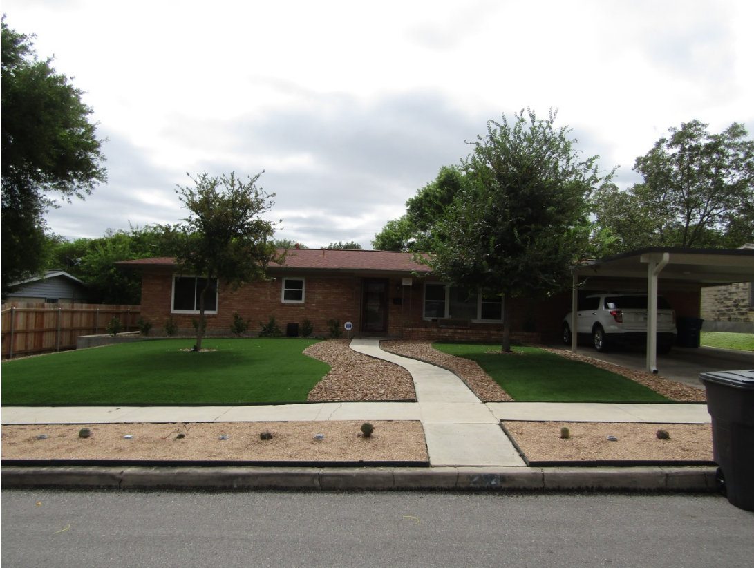
Fence within the Front Yard, 6' Height