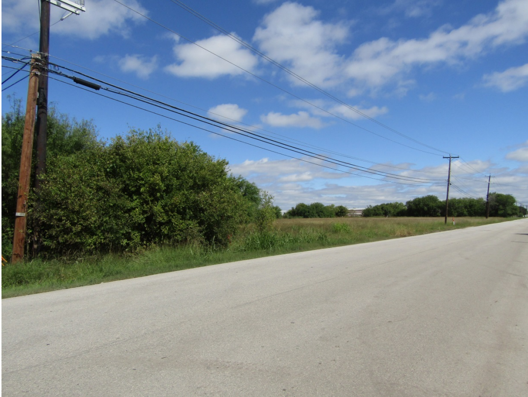
Dietrich Road View to the East