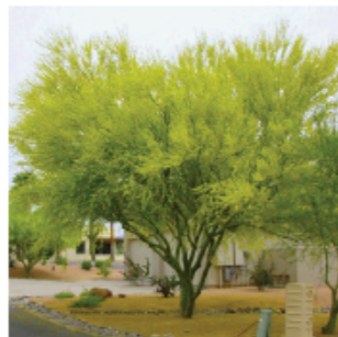
Palo Verde Desert Museum Parkinsonia x 'Desert Museum' 10' height x 7' spread submit to dwg.