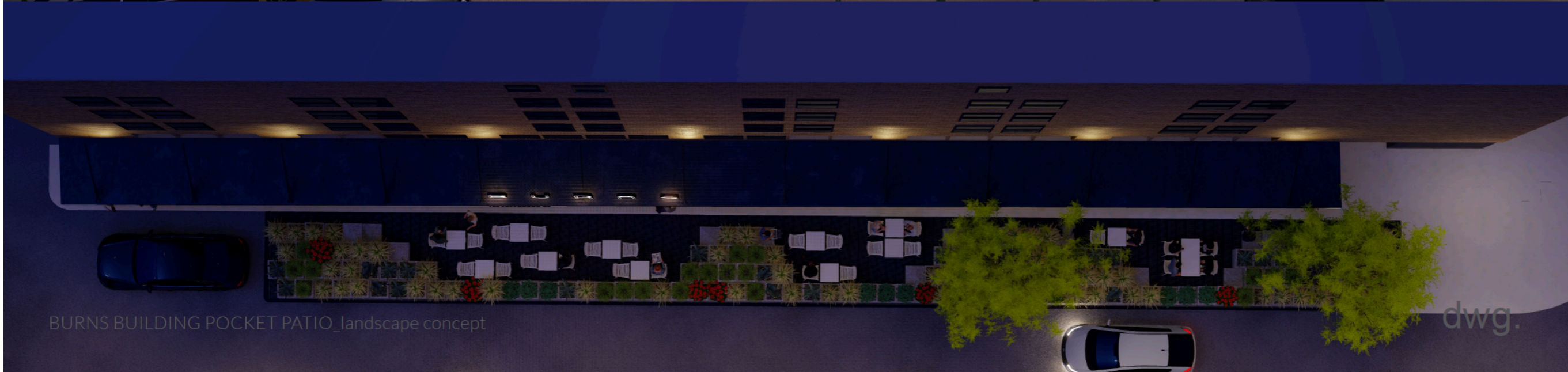
BURNS BUILDING POCKET PATIO_landscape concept