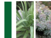
Squid Agave Agave bracteosa [1] 17" x 17" submit to dwg. Ghost-plant Graptopetalum paraguayense [4] 6" per planter at corners