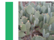
Spineless Prickly Pear 'Ellisiana' Opuntia ellisiana 7 gallon