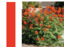
Pride of Barbados Caesalpinia pulcherrima 3 gallon