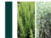
Upright Rosemary Rosmarinus officinalis 'upright' 3 gallon Silver Ponyfoot Dichondra argentea 'silver falls' [4] 6" per planter at corners