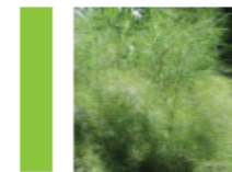
Bamboo Muhly Muhlenbergia dumosa 3 gallon