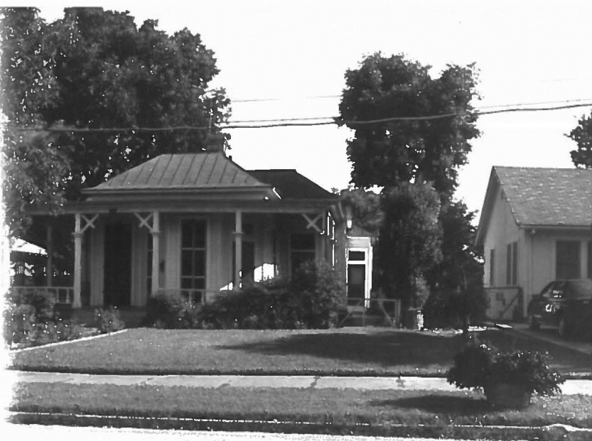
1994 SURVEY PHOTO