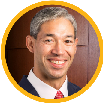
RON NIRENBERG - MAYOR