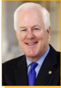
JOHN CORNYN SENATOR