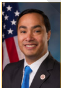
JOAQUIN CASTRO REPRESENTATIVE DISTRICT 20