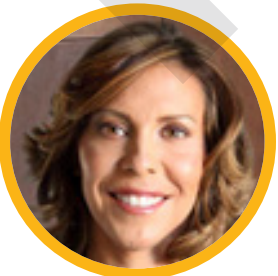
SHIRLEY GONZALES DISTRICT 5