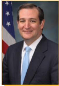
TED CRUZ SENATOR