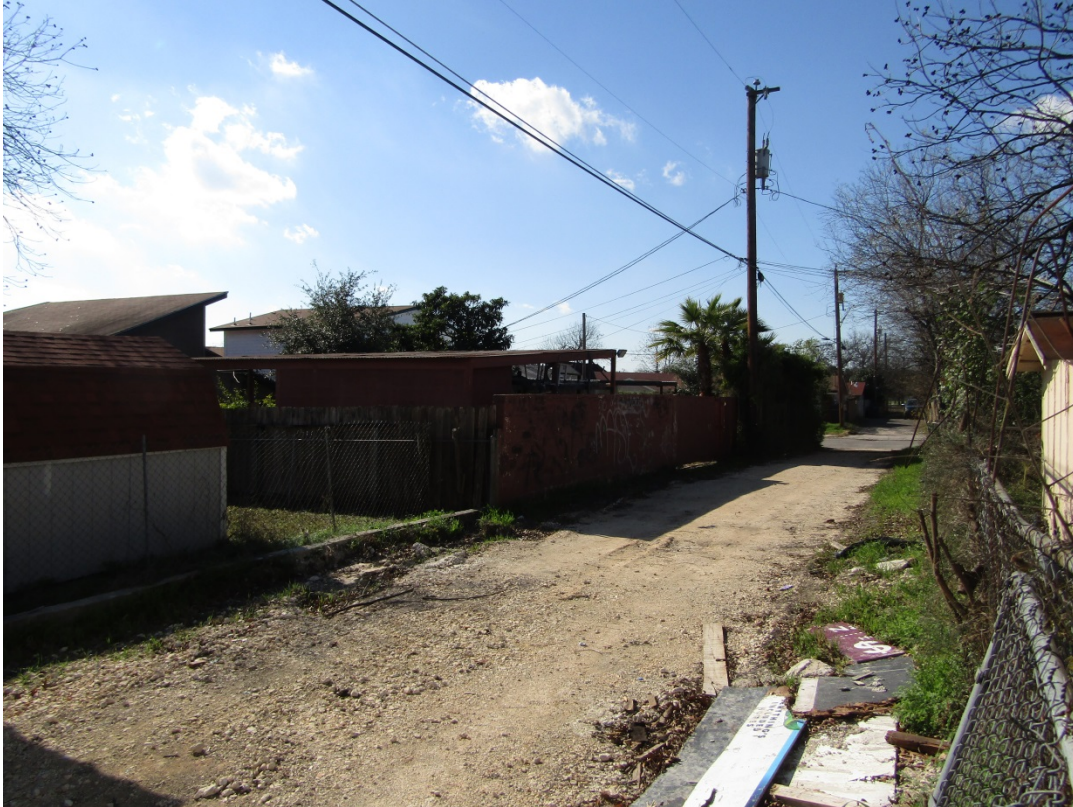
Similar Structure locate in the rear