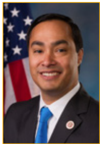
JOAQUIN CASTRO REPRESENTATIVE DISTRICT 20