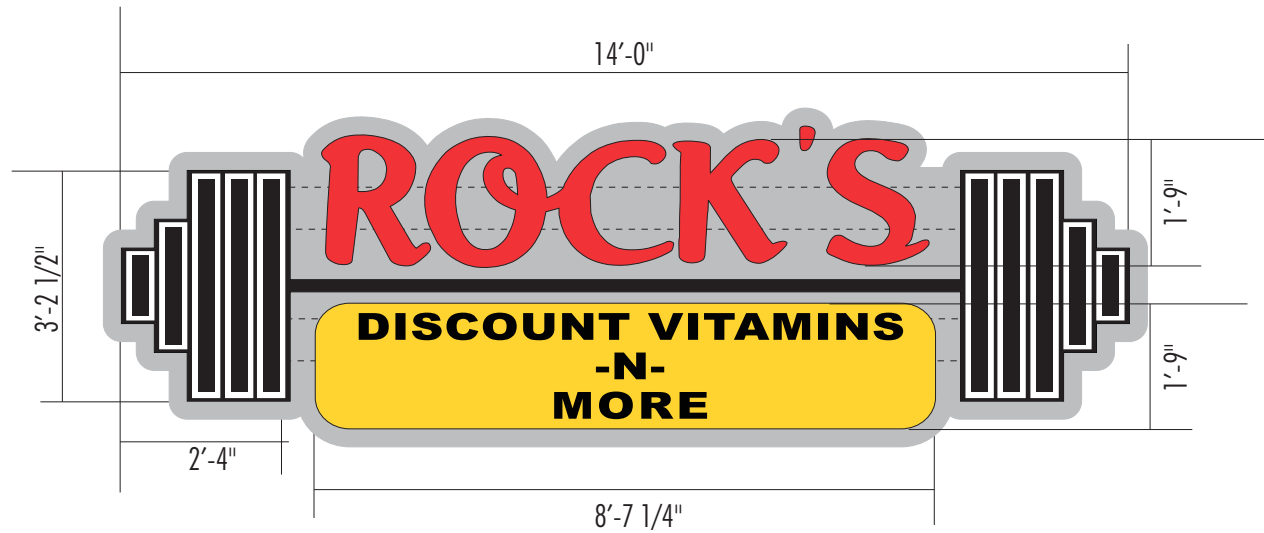
Front View - Scale: 3/8"=1'-0"

Specifications: Install one (1) set of customer supplied channel letters. Add 1/8" backer panel with 3" border all around. Repaint raceways to match building. Add photocell. Manufacture and install one (1) new face for "Discount Vitamins — More" cabinet. 3/16" plexi with applied opaque yellow vinyl with perforated black vinyl copy.