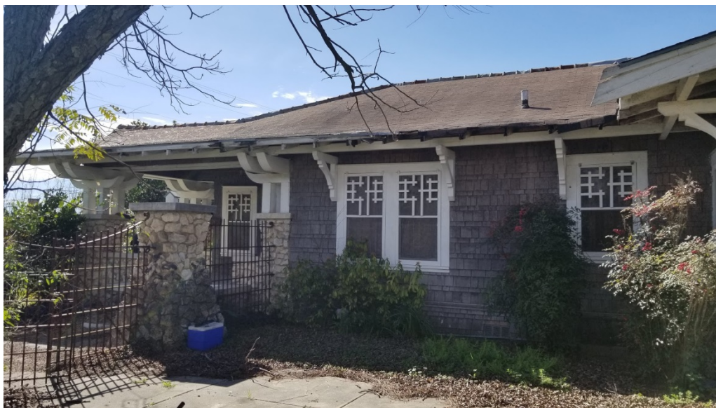
South half of east facade

1901 S. ALAMO ST, SAN ANTONIO, TEXAS 78204