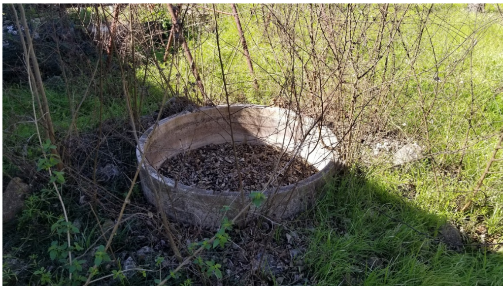
Cistern near northeast corner of structure

1901 S. ALAMO ST, SAN ANTONIO, TEXAS 78204