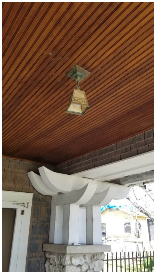
Porch ceiling and metal pendant light

1901 S. ALAMO ST, SAN ANTONIO, TEXAS 78204