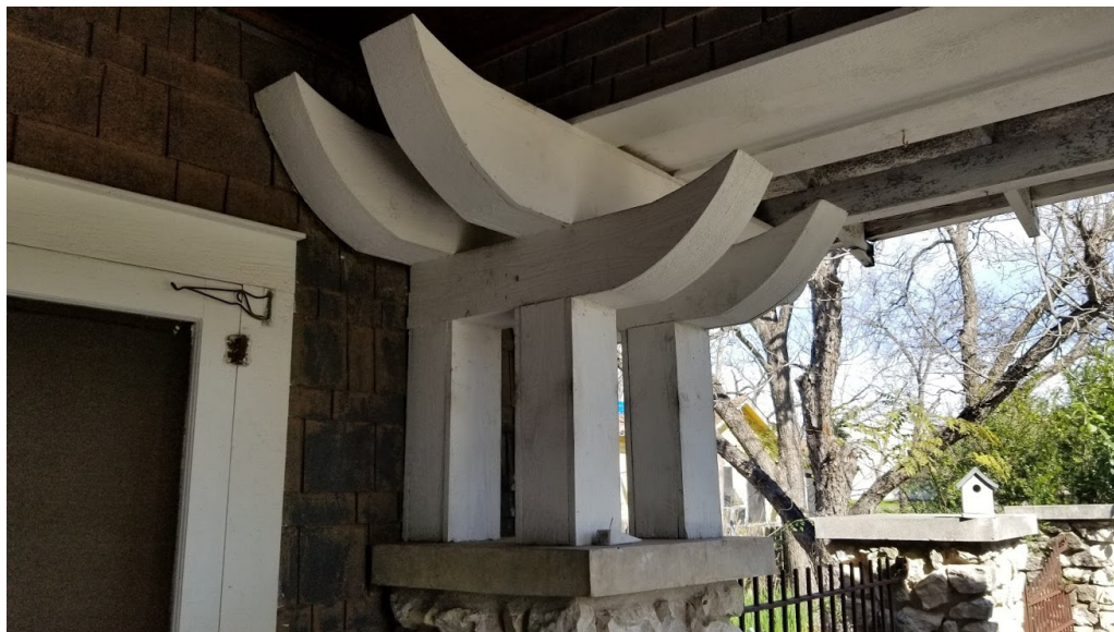
A closer view of the porch columns and beams. Construction method is readable in the joinery.