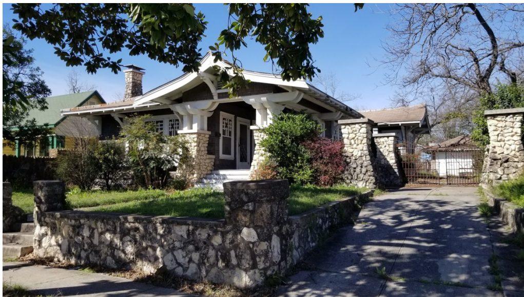
South (primary) facade