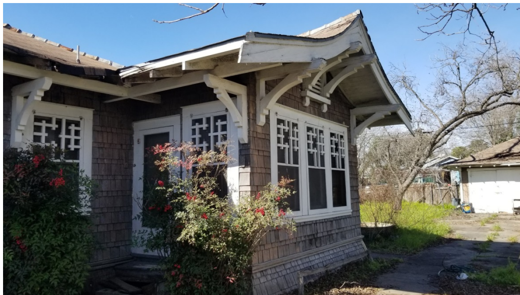
North half of east facade