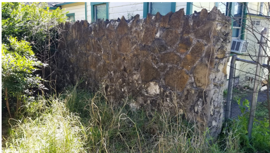
Stone wall along west edge of parcel

1901 S. ALAMO ST, SAN ANTONIO, TEXAS 78204