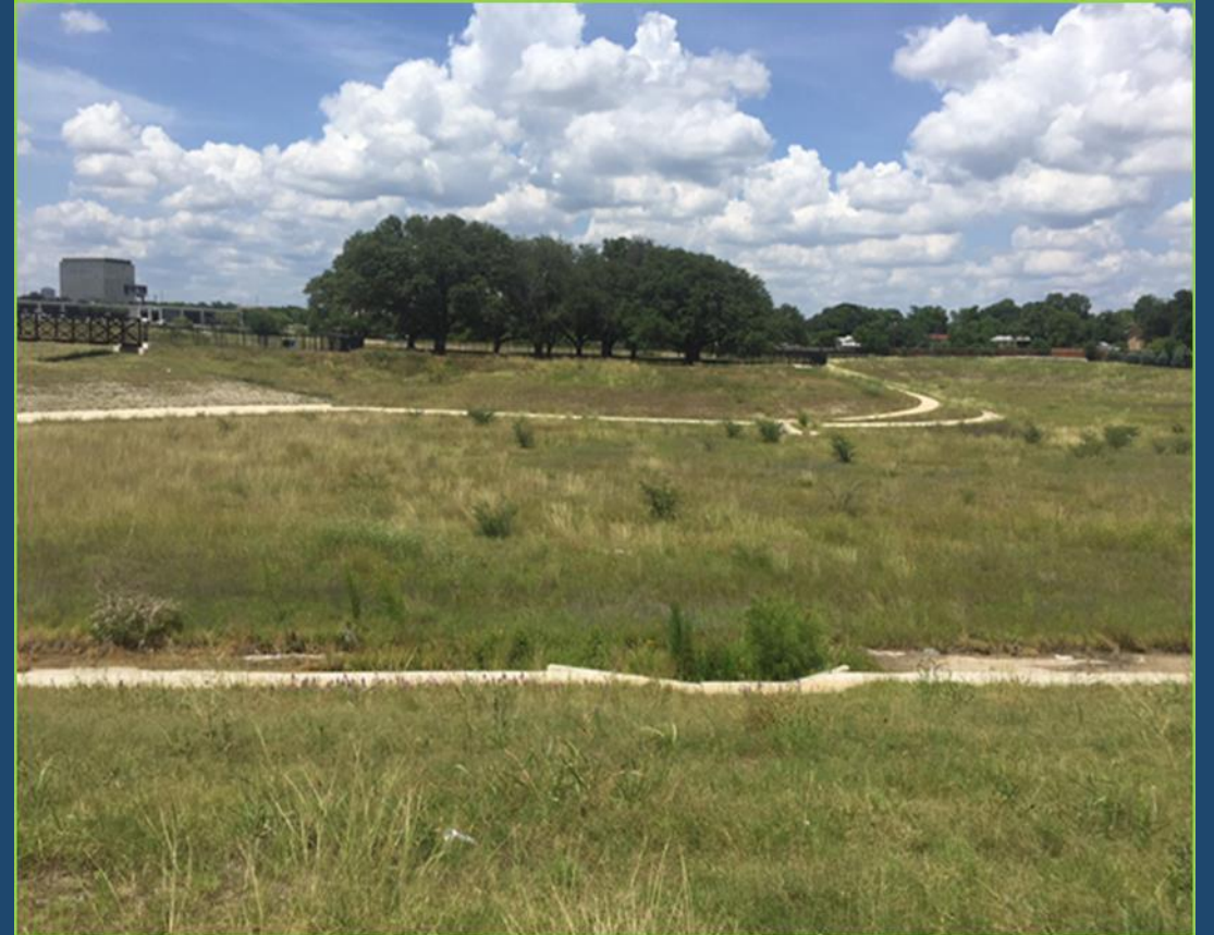
South basin conversion to practice sports fields