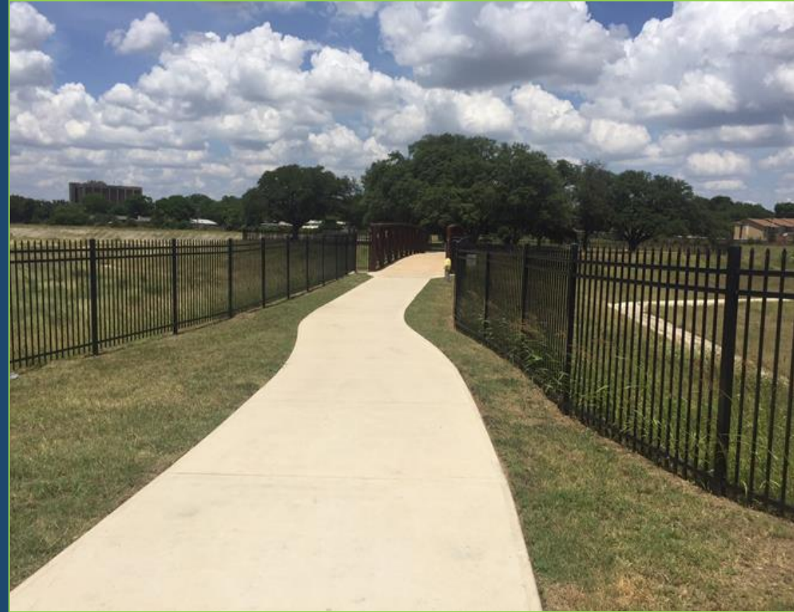
East view of center of park