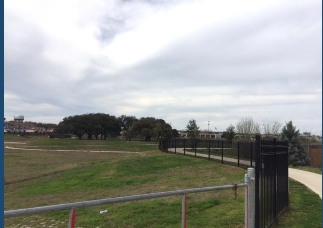
View of the south basin and tree cluster within the central area of the park.