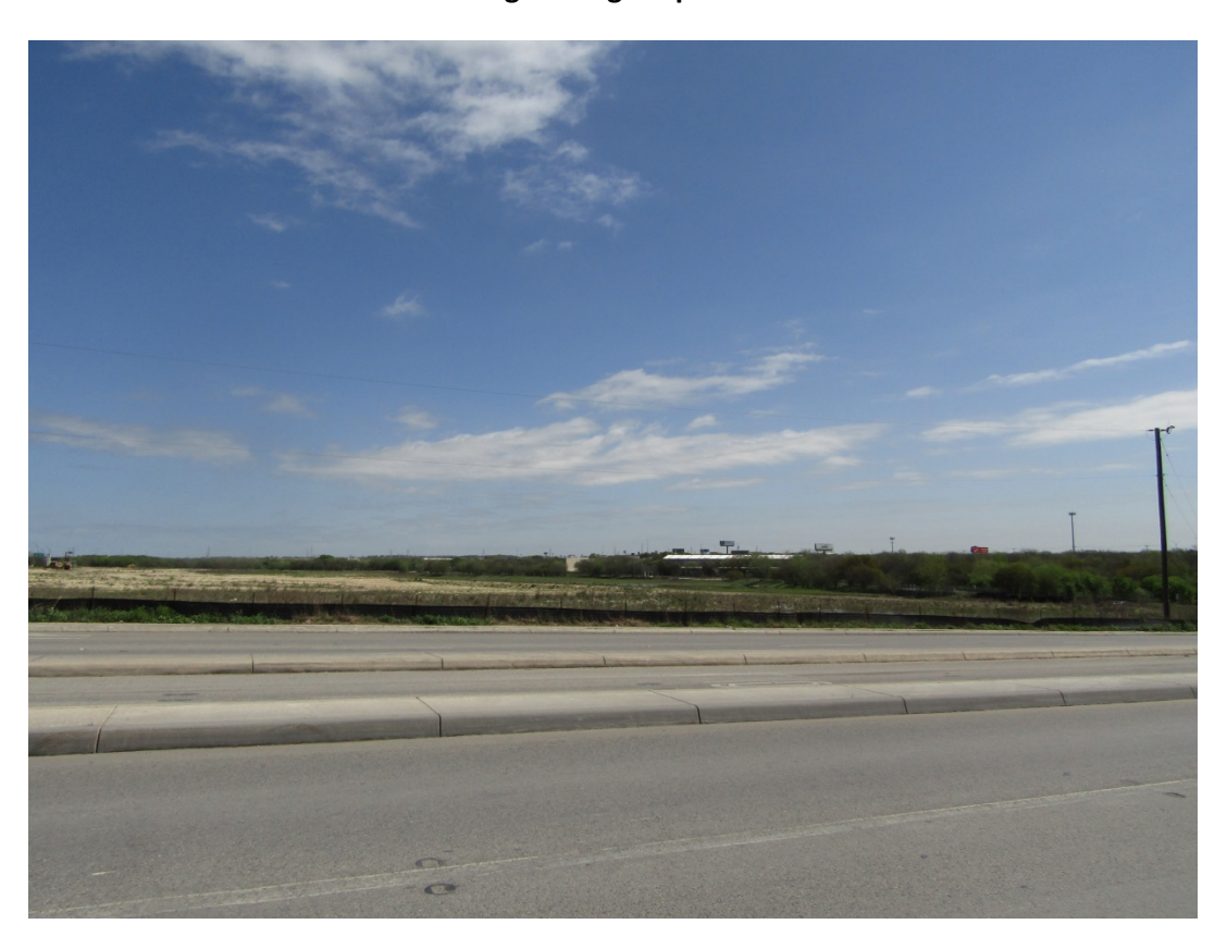
View towards Wurzbach Road