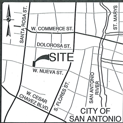
LOCATION MAP NOT-TO-SCALE

OPR OFFICIAL PUBLIC RECORDS OF BEXAR COUNTY, TEXAS DPR DEED AND PLAT RECORDS OF BEXAR COUNTY, TEXAS FD FOUND