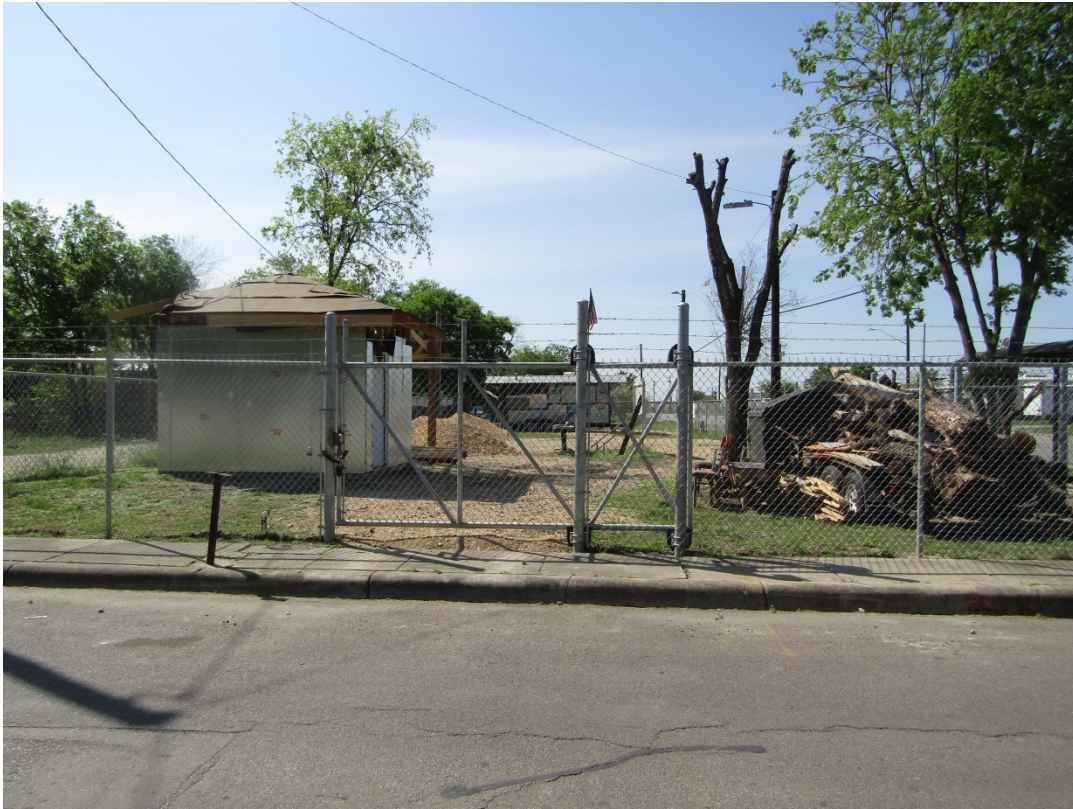
Subject Property Side View