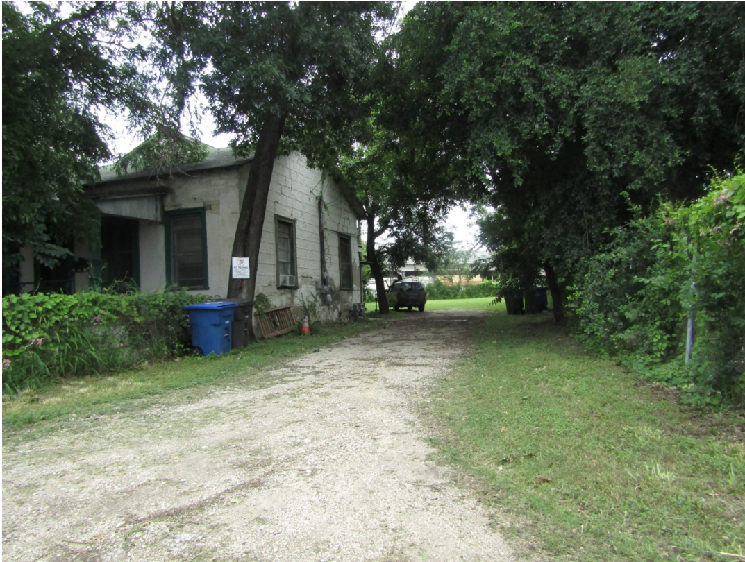
IH-37 Neighboring Properties