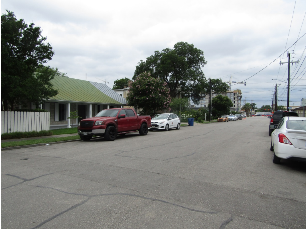
Union Street Neighboring Properties