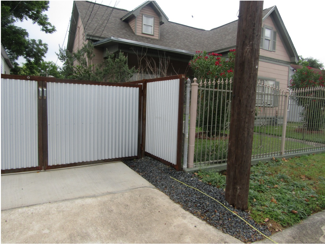
Rear of Subject Property