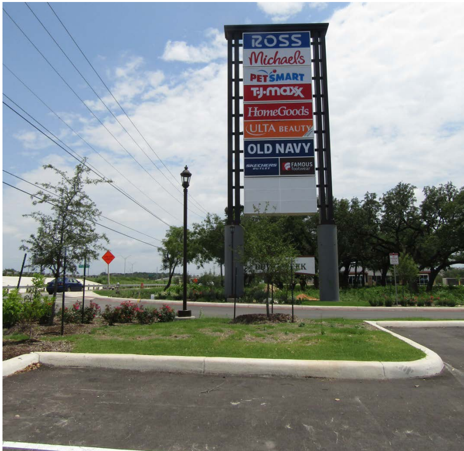
Sign along Loop 1604

Subject Property – Loop 1604 and Potranco Road primary sign (A)