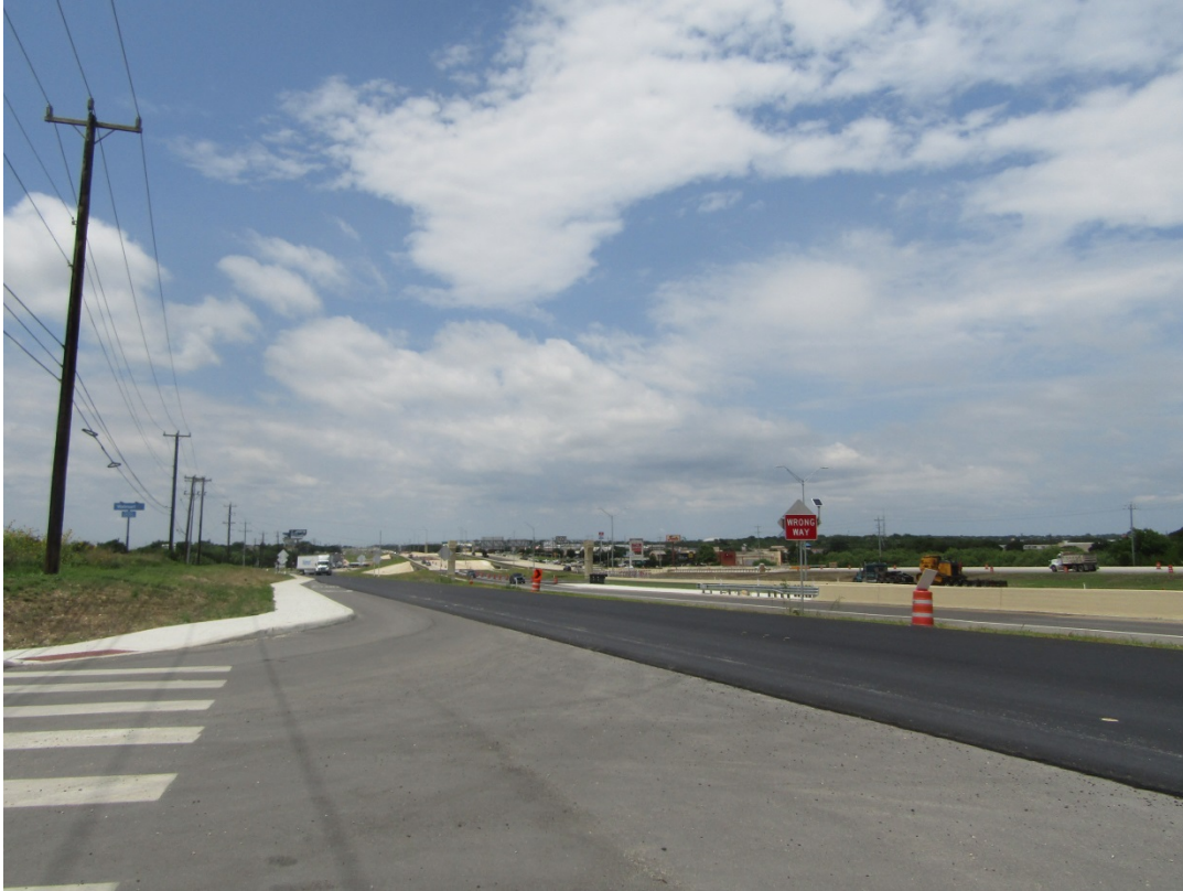
Loop 1604 View