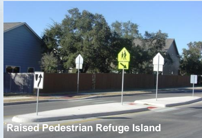
Raised Pedestrian Refuge Island