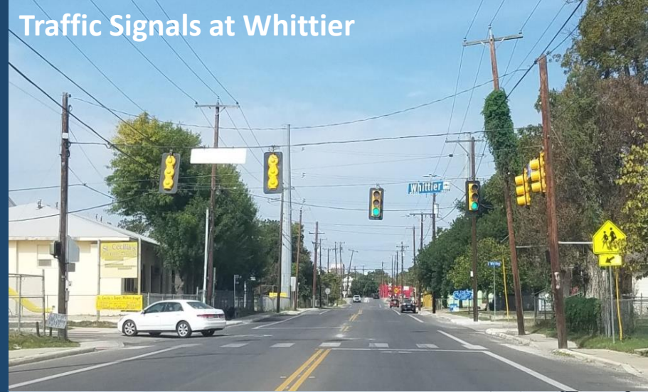
Looking Southbound just south of Southcross