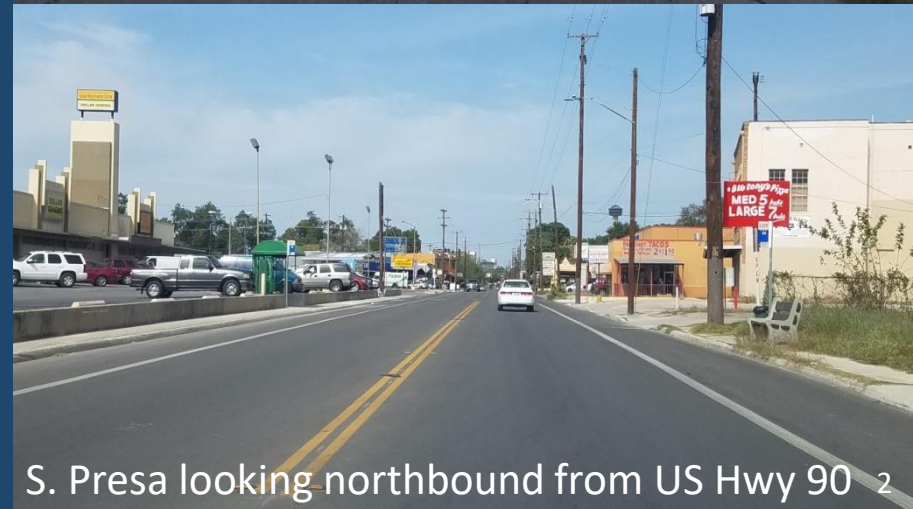
S. Presa looking northbound from US Hwy 90 2