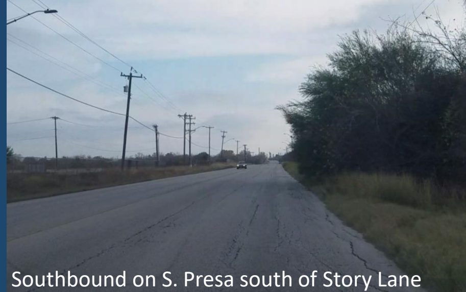
Southbound on S. Presa south of Story Lane