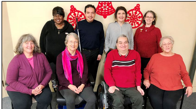
Disability Access Advisory Committee