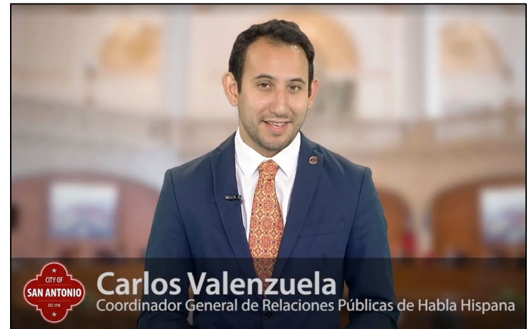
Spanish Language Liaison