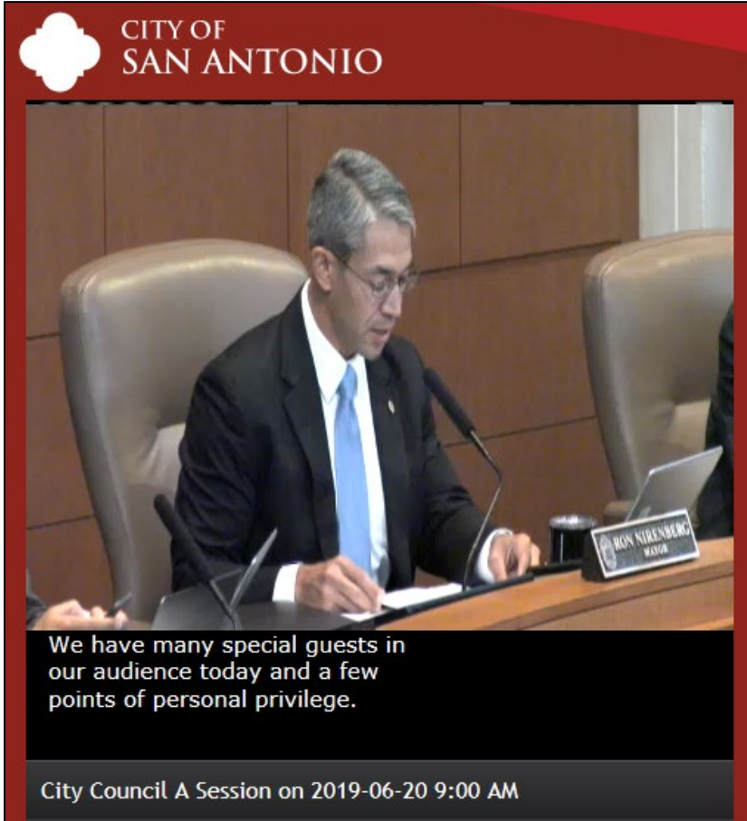
Closed Captioned & SAP Council Meetings