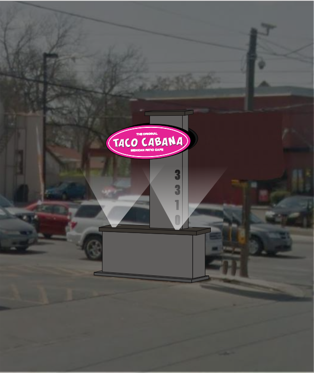
NIGHT VIEW SCALE: 1/8"=1'-0"