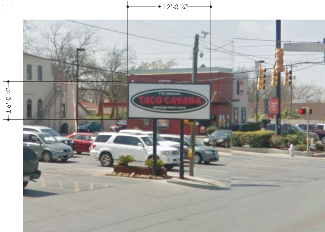
EXISTING ELEVATION SCALE: 1/8"=1'-0"