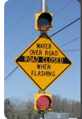
High Water Detection