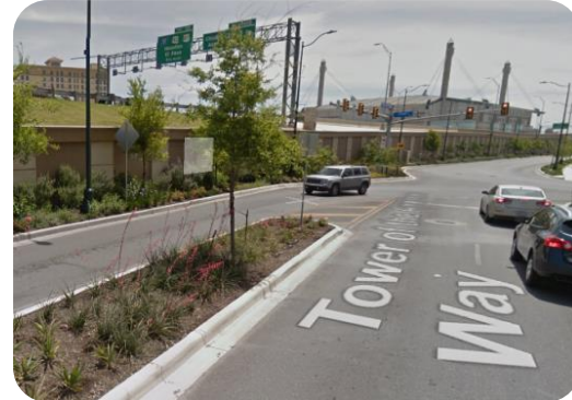
Road Vegetation Maintenance