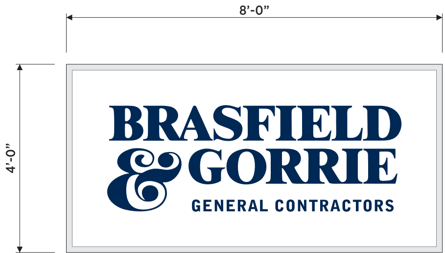
2 FRONT VIEW SCALE: 1/2" = 1'