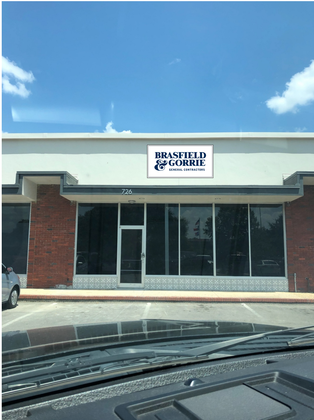
1 CONTEXT LAYOUT SCALE: 1:80