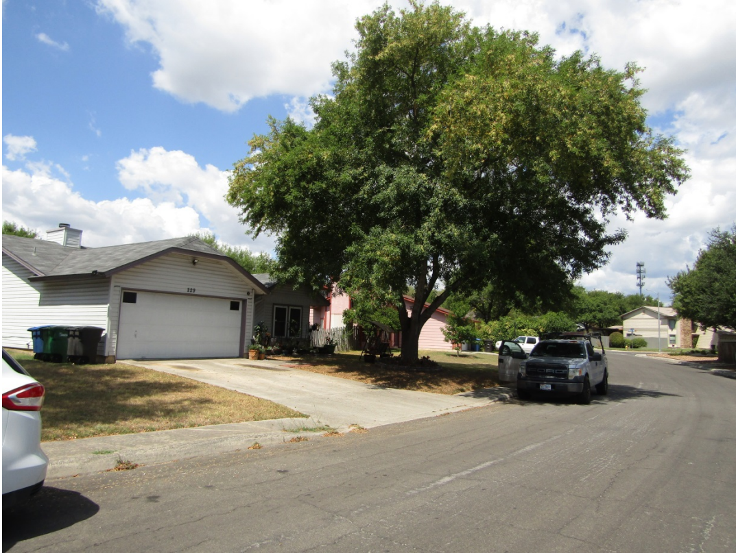
Street view - Saddlebrook Dr.