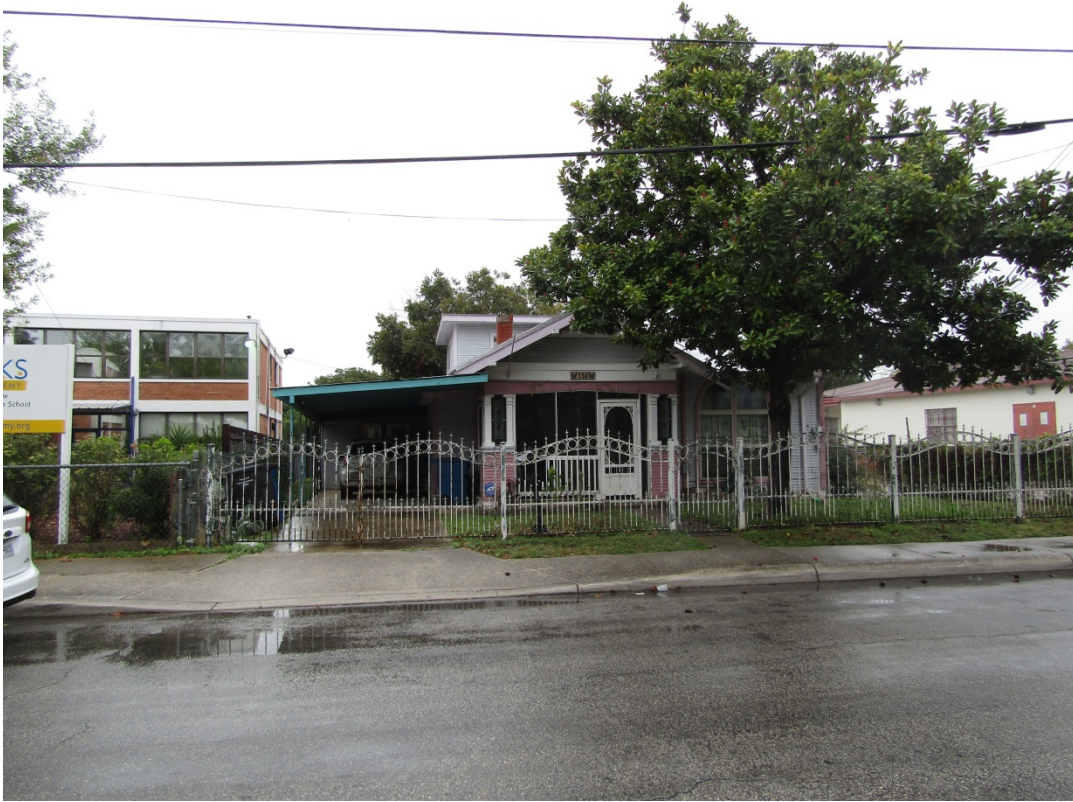
E Lambert Street View