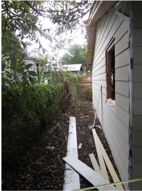
Subject Property Rear Setback