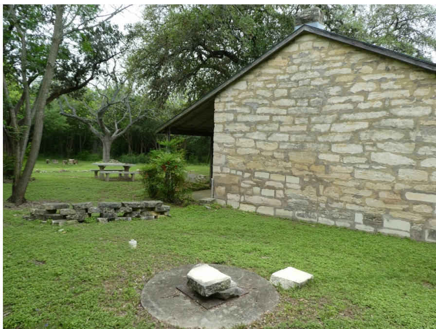
Photos from c. 2018 showing the location of a chimney lost in a roof replacement.