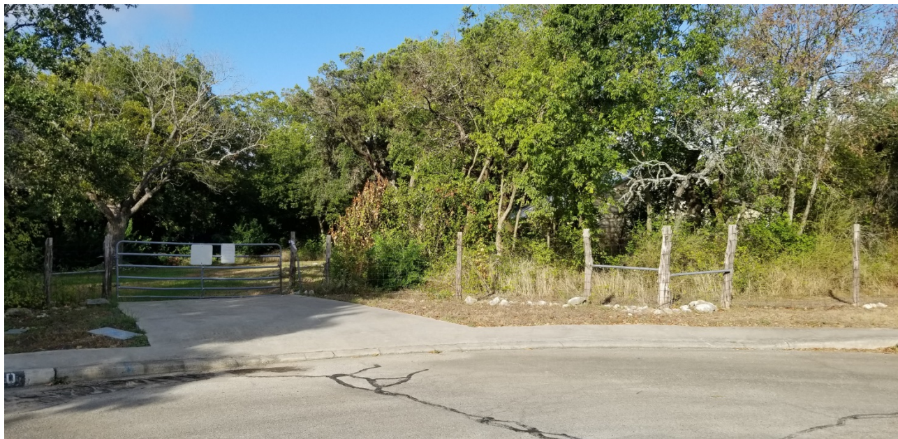
View of parcel from the right-of-way.