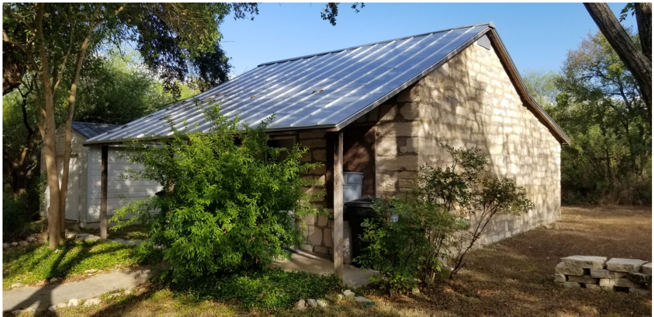
Primary (south) and east façades.

A property must meet at least three of the 16 criteria used to evaluate eligibility for landmark designation, and this assessment determines that 16000 Hickory Well Dr meets this threshold. Therefore, staff recommends a finding of historic significance for the property at 16000 Hickory Well Dr. Further research may reveal additional significance associated with this property.