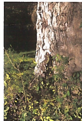
Oak tree with current damage