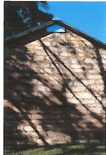
Full Side Of House