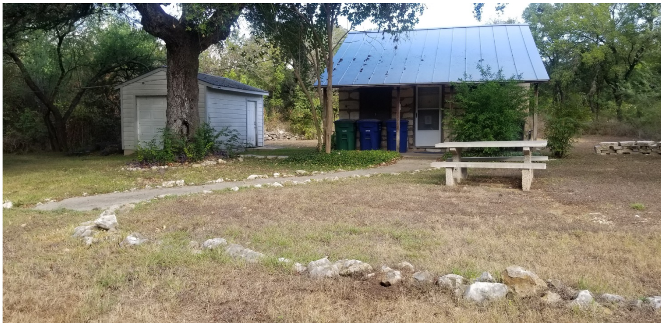
Primary façade and adjacent noncontributing modern garage.