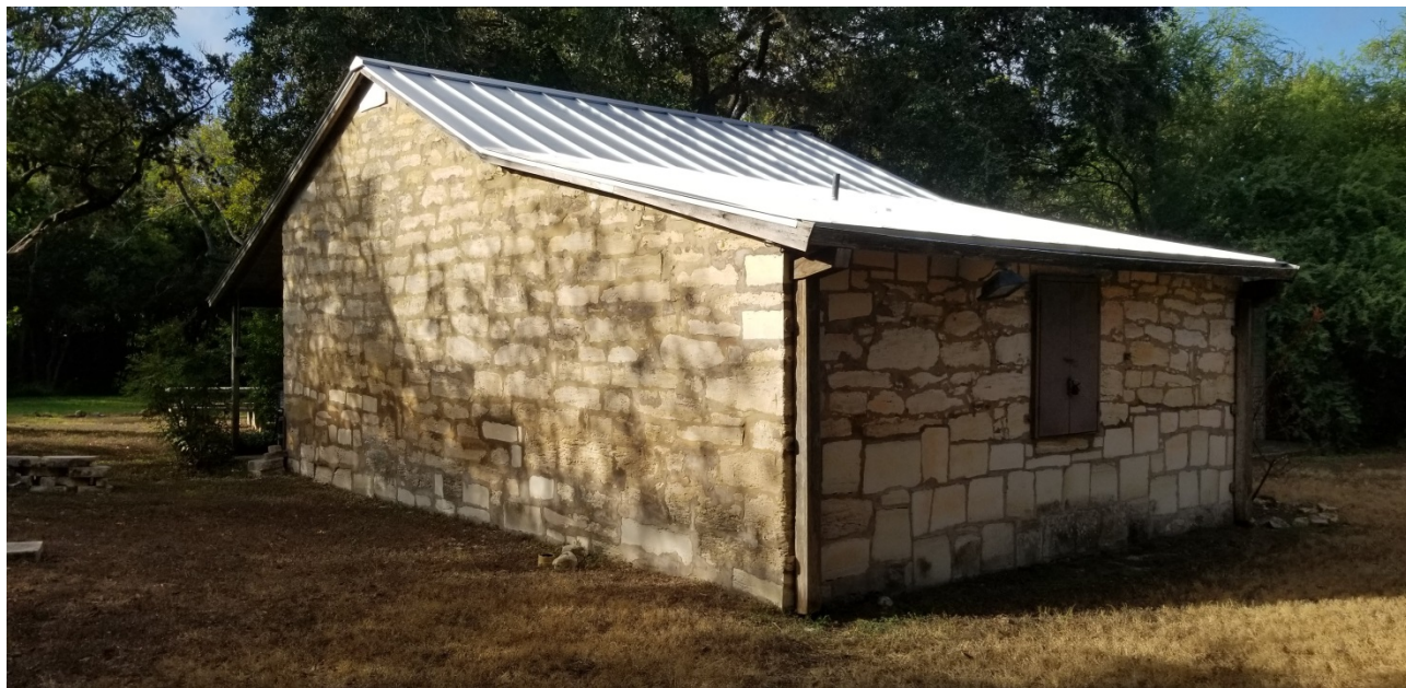
Rear (north) and east façades.