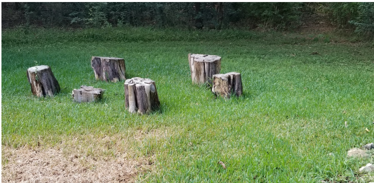
Location of suspected springs, surrounded by tree stumps.

1901 S. ALAMO ST, SAN ANTONIO, TEXAS 78204