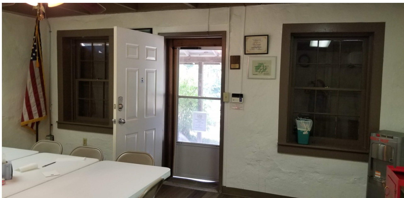
Interior view showing south-facing windows on primary façade, otherwise hidden by steel window gates.

1901 S. ALAMO ST, SAN ANTONIO, TEXAS 78204