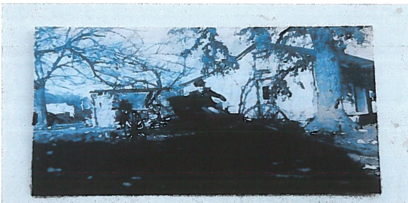
Rock House with "Aunt Lisette" and damaged oak tree