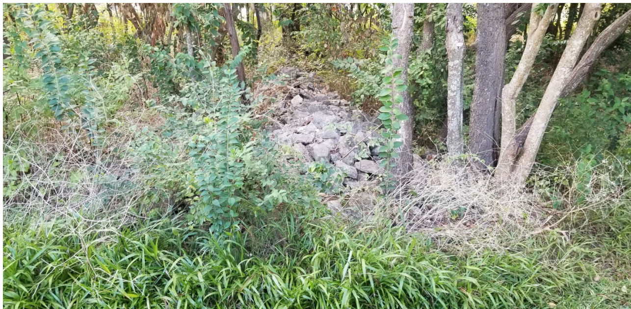
Low stacked stone wall found at the west edge of the property.