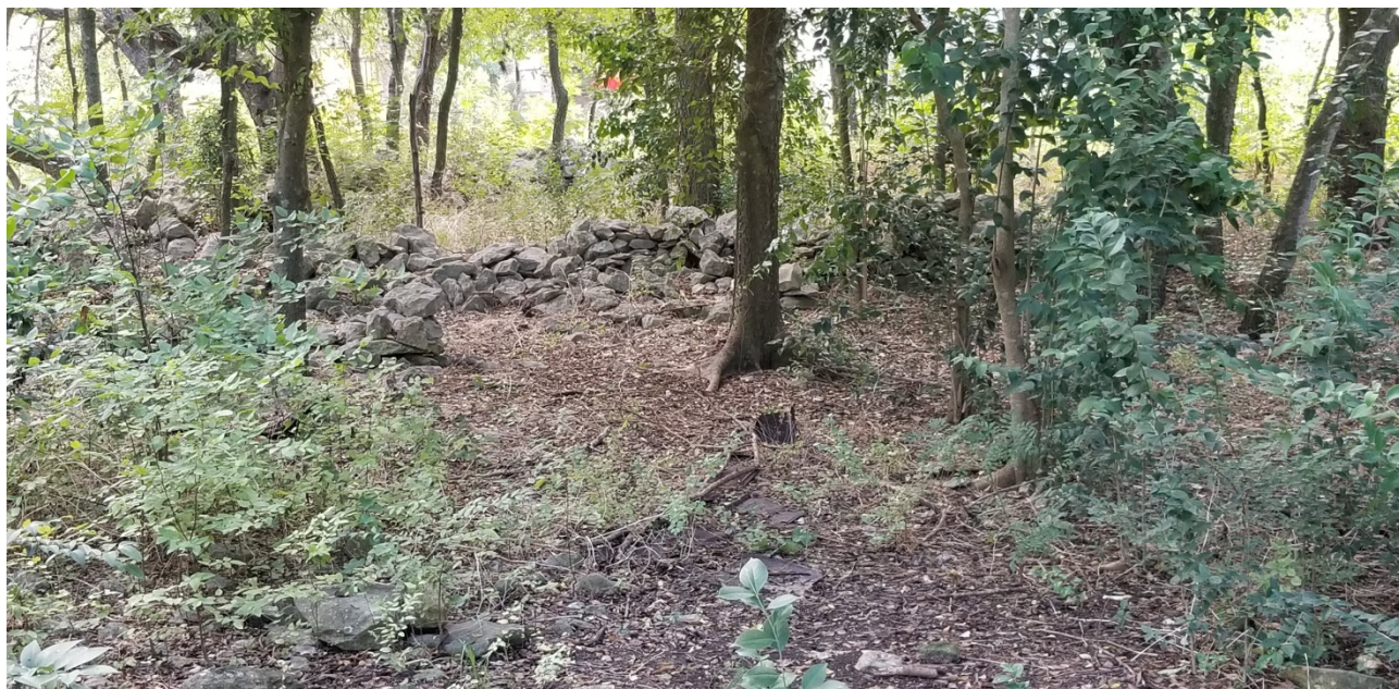
Low stacked stone walls found along the southern section of the property.

1901 S. ALAMO ST, SAN ANTONIO, TEXAS 78204