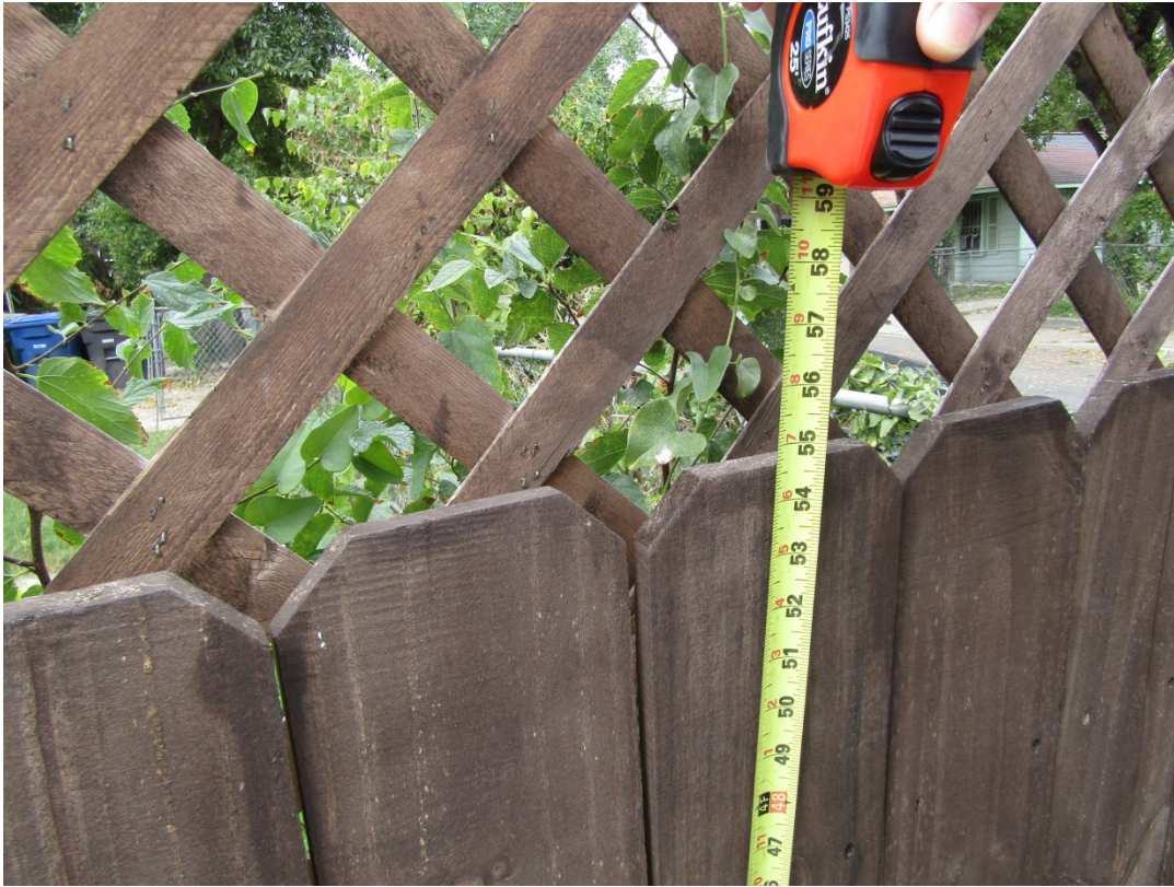
Subject Property-Front Fence Height