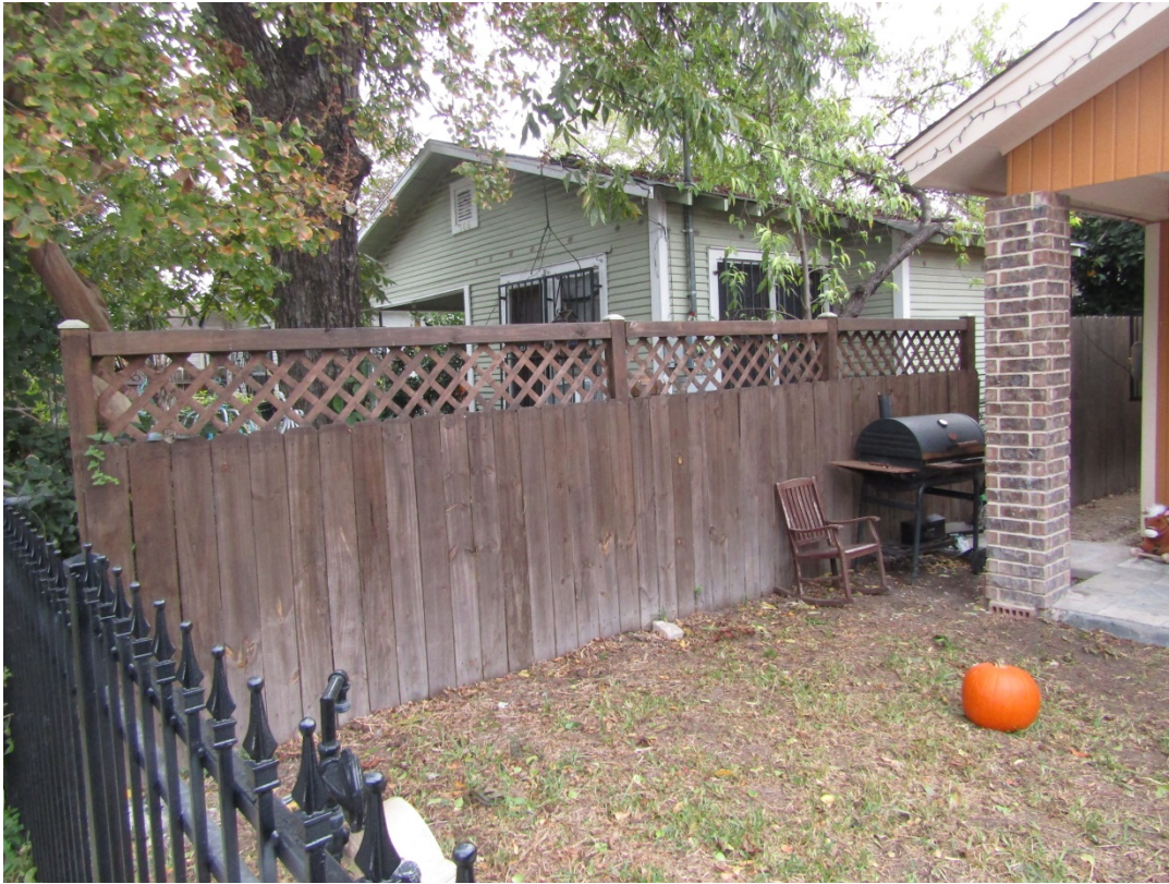
Subject Property-Rear building setback