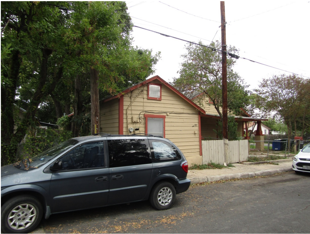
Gould Street View