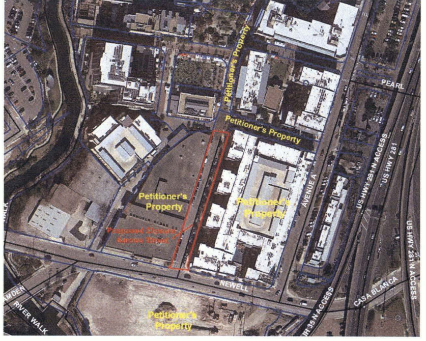
City of San Antonio