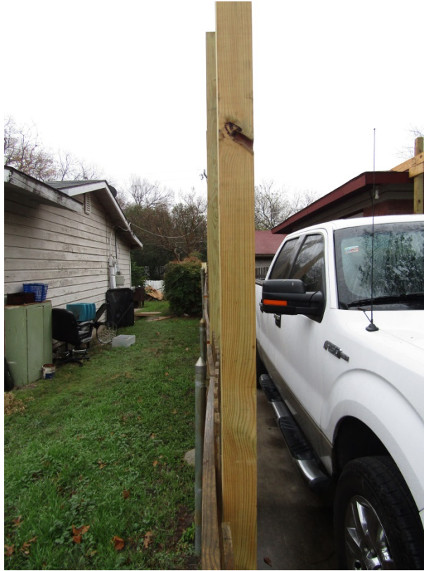
Subject Property Carport Width