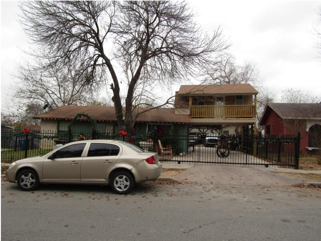
Subject Property's Carport and Attached Dwelling Unit