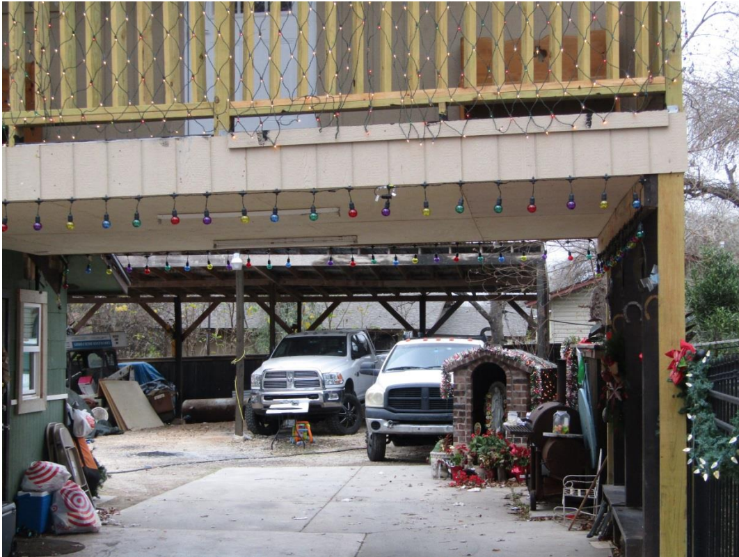
Attached Carport Posts to Fence Line