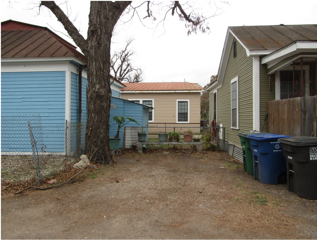
Subject Property Rear House