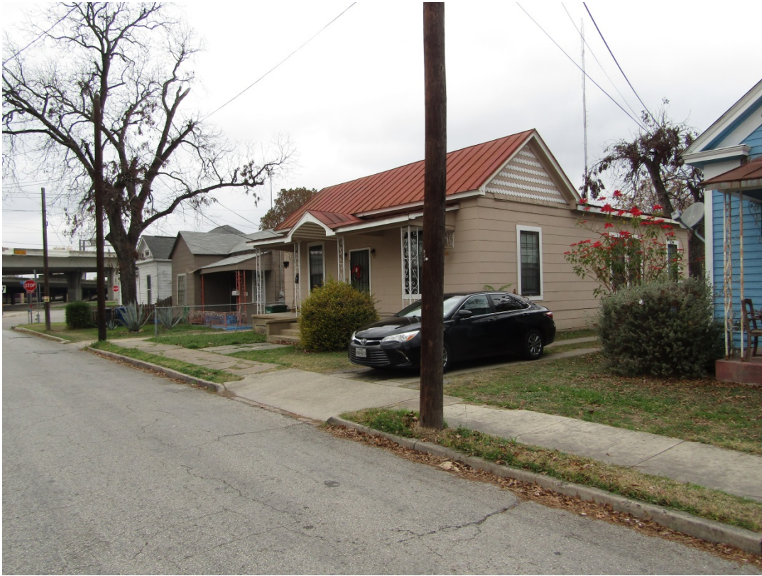
West Cypress Street View