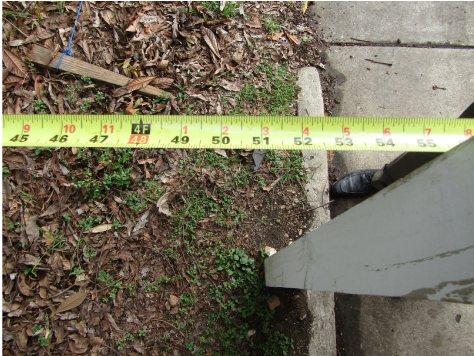
Carport Support Pillar to Driveway Edge