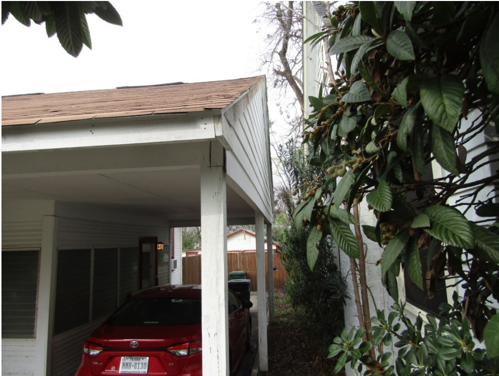
Measurement from Subject Property Carport to Neighboring Structure