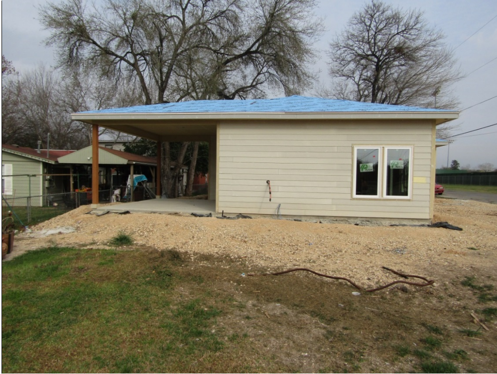
Subject Property Front Porch