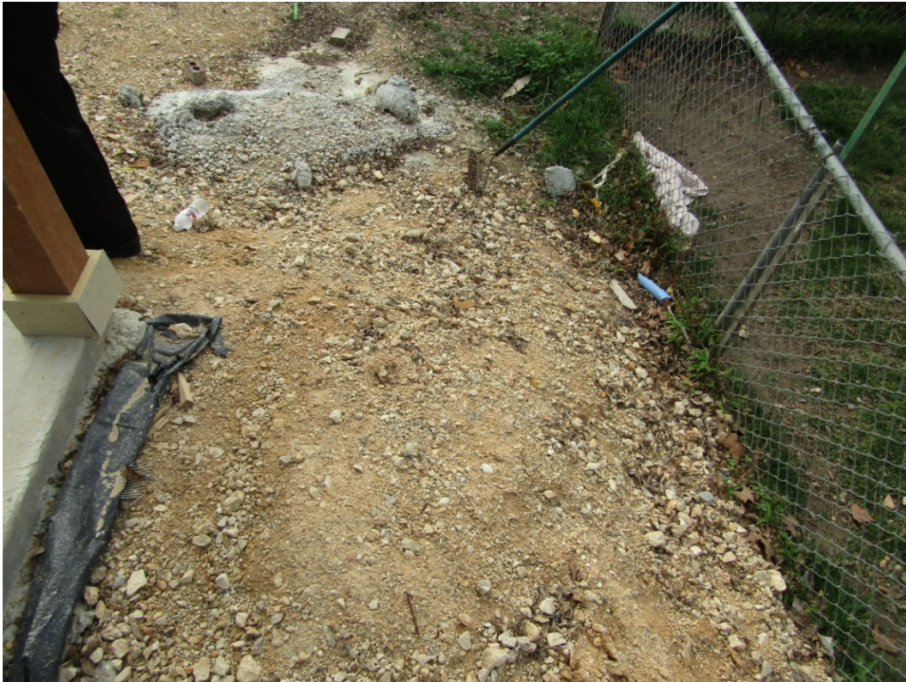
Side Yard Setback- North