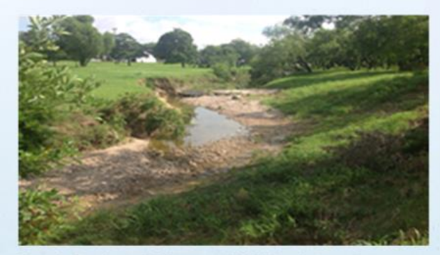
Bank Failure/Channel Widening