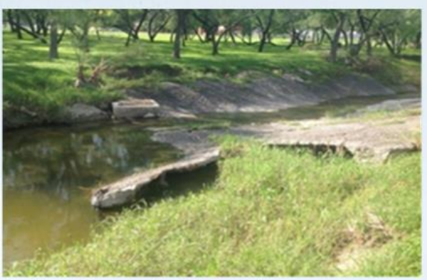
Broken Concrete Channel