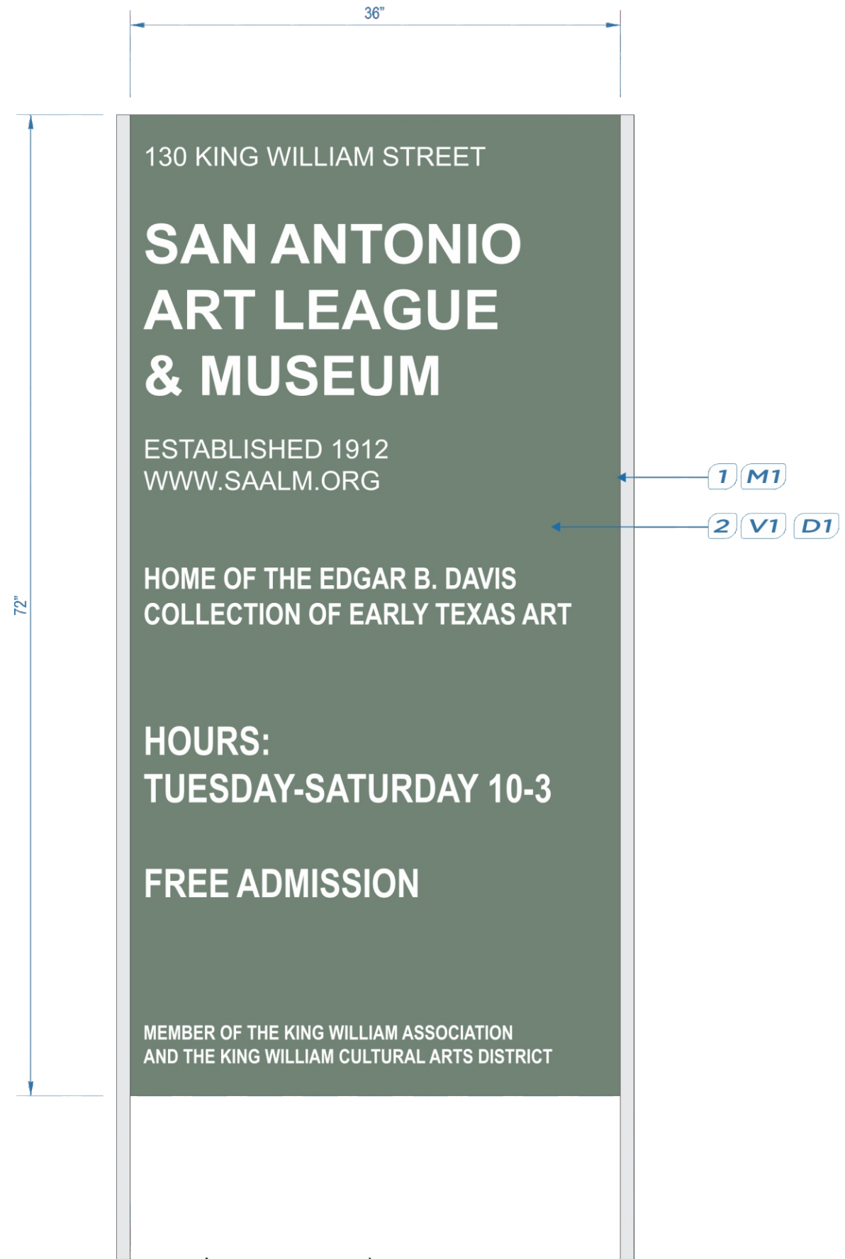
TYPE: 1 | SIGN ELEVATION | FRONT AND BACK VIEW

SCALE: 1" = 10" QUANTITY: 1 MANUFACTURE AND INSTALL