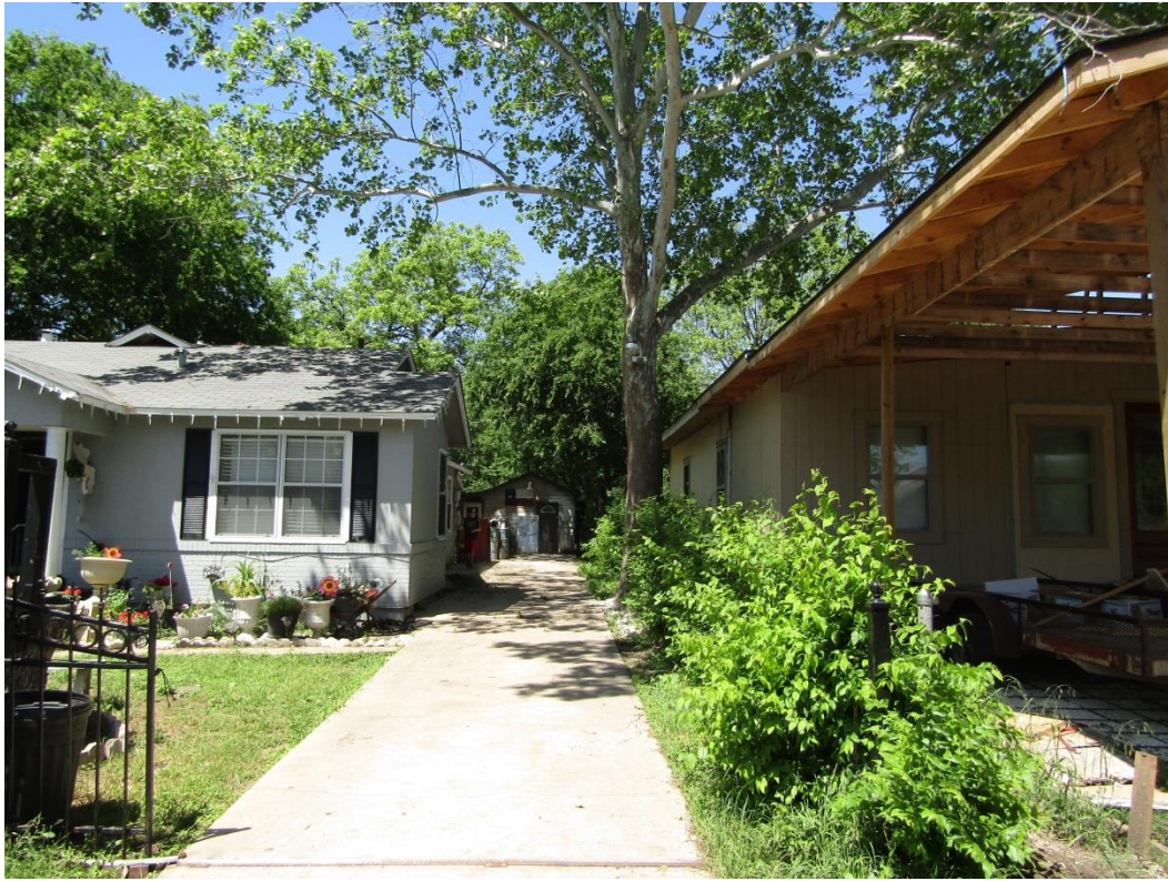
Adjacent Property and side setback