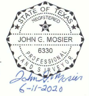
EXHIBIT OF A 2.064 ACRE PORTION OF WOODRUFF AVENUE NEW CITY BLOCK 10934, CITY OF SAN ANTONIO, BEXAR COUNTY, TEXAS.

JOHN G. MOSIER REGISTERED PROFESSIONAL LAND SURVEYOR NO. 6330 601 NW LOOP 410, SUITE 350 SAN ANTONIO, TEXAS 78216 PH. 210-541-9166 greg.mosier@kimley-horn.com