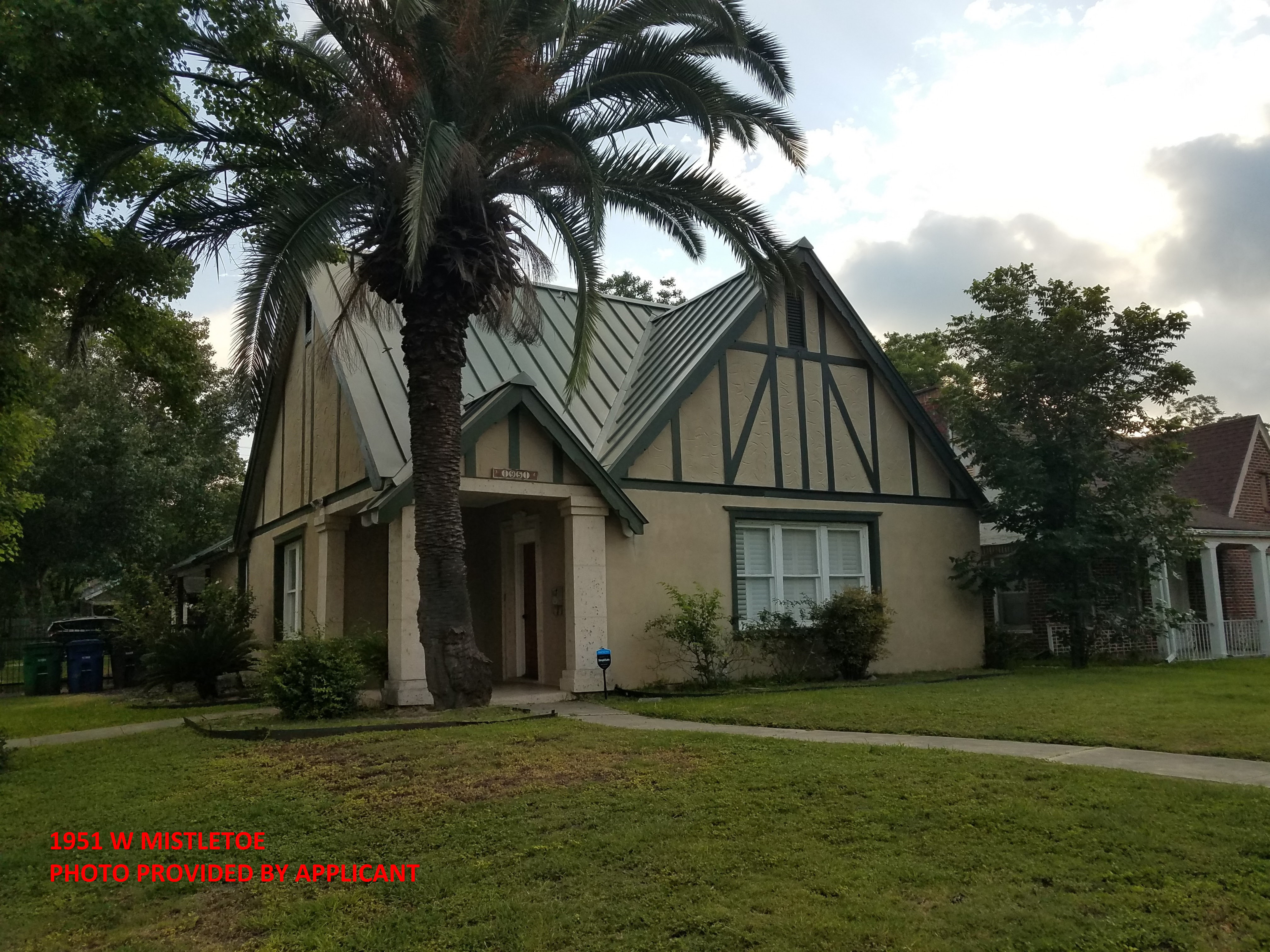
1951 W MISTLETOE