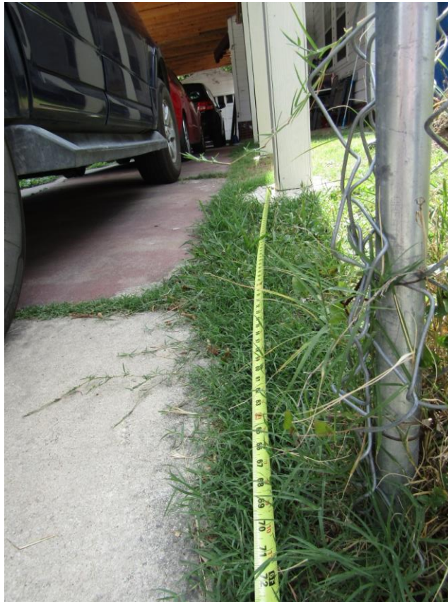
Adjacent Property (Southside neighbor)